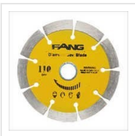
Diamond Marble Cutter