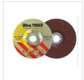
Ultra Touch DC Wheel