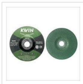
Green Wheel Cutting Blade