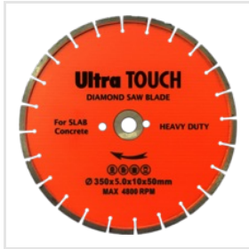
Ultra Touch Concrete Cutter Blade