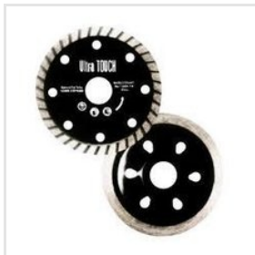
Ultra Touch Flat Cup Wheel