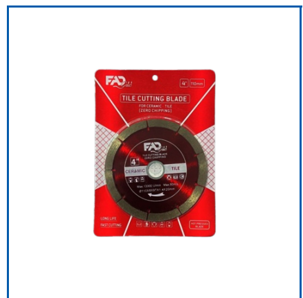
FAD ZERO CHIPPING GRANITE CUTTING BLADE