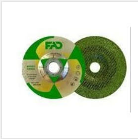
FAD Green GC Wheel