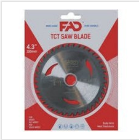
FAD TCT Circular Saw Blade