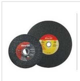
Ultra Cut Cutting Wheel Black