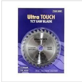
TCT Saw Blade