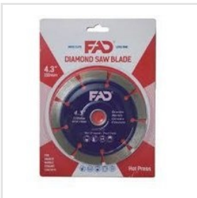
FAD Granite Cutting Blade (Hot Pressed)