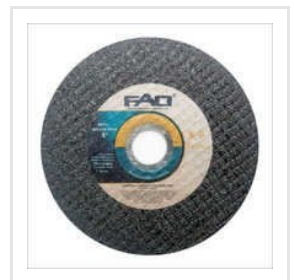
Black Cutting Wheel