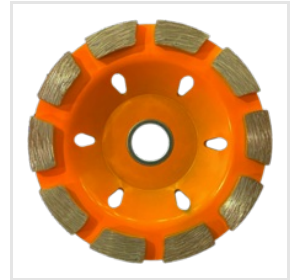
Ultra Touch Diamond Cup Wheel