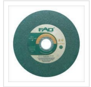
Green Cutting Wheels