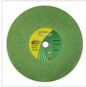
Ultra Cut Cutting Wheel Green