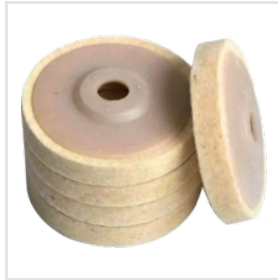
Felt Wheel (Wool)