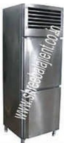
Two Door Vertical Refrigerator