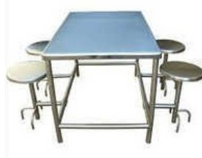
SS Dining Table 4 Seater