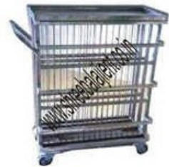
Clean Plate Rack Trolley