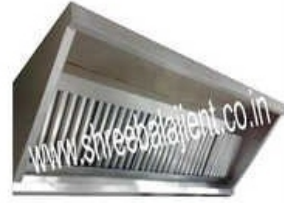
S.S. Exhaust Hood