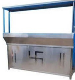
Fast Food Counter