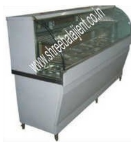
Cold Display Counter