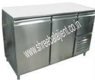
Marble Top Under Counter Refrigerator