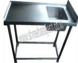
Single Sink Unit With Table