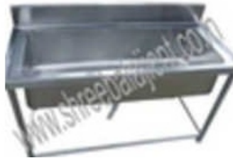
Pot Wash Sink