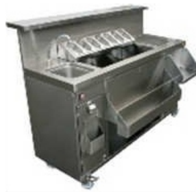
Bar Counter With Sink