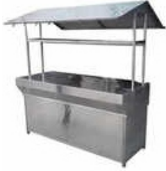
Pav Bhaji Counter