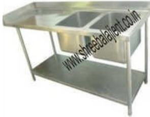
Two Sink Unit With Table