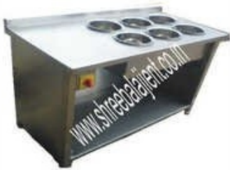
Bain marie Counter With 6 Pot