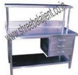
Working Table For S.S.