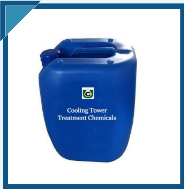
Cooling Tower Chemicals