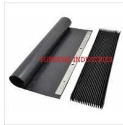
CNC Machine Bellow