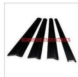
CNC VMC TELESCOPIC WIPER