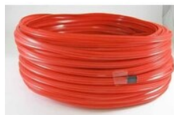
C2 RED LIP CNC MACHINE WIPER