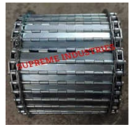
CNC Conveyor Chain