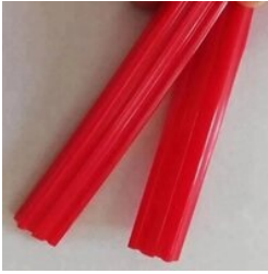
Rubber C2 Red Lip Cnc Machine Wiper