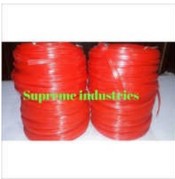
Red Rubber C2 Lip Wiper