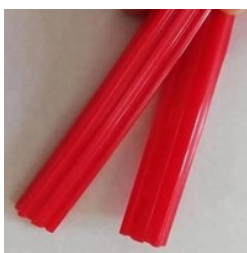
RUBBER C2 RED LIP CNC MACHINE WIPER

Bellow Cover, C2 Casing with C2 PU Rubber Wiper, C2 Red Lip CNC Machine Wiper, CNC Conveyor Chain, CNC Machine Bellow, CNC VMC Telescopic Wiper, Conveyor Chain, Red Rubber C2 Lip Wiper, Rubber C2 Red Lip Cnc Machine Wiper, etc.