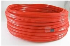
C2 Red Lip CNC Machine Wiper