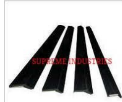
CNC VMC Telescopic Wiper