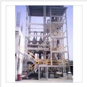
Forced Circulation Evaporators