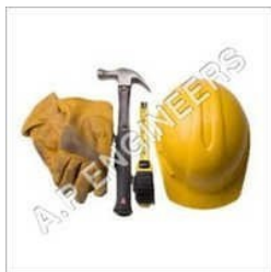
LABOUR JOB WORK

Biological Effluent Treatment Plant, Drinking Water RO Plant, Effluent Treatment Plants, Effluent Water Treatment Plant, Engineering Consultancy Services, Falling Film Evaporators, Film Forced Circulation Evaporators, Fish Feed Cooler, Fish Meal Plant Machinery, Fluid Industry Turnkey Projects, Forced Circulation Evaporators, Heat Recovery Evaporators, High Pressure Cleaning Pumps, Incinerator System, Industrial Reverse Osmosis Plant, etc.