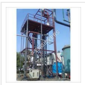
Multiple Effect Evaporators