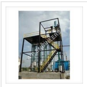
Film Forced Circulation Evaporators