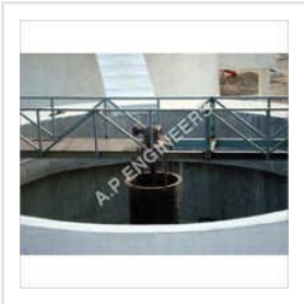
Effluent Water Treatment Plant