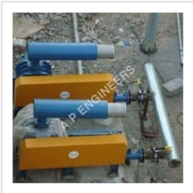
Effluent Treatment Plants