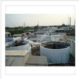
Tertiary Clarifier System