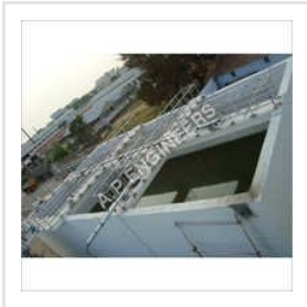
Biological Effluent Treatment Plant