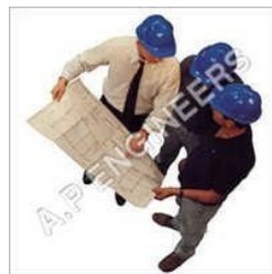
FLUID INDUSTRY TURNKEY PROJECTS