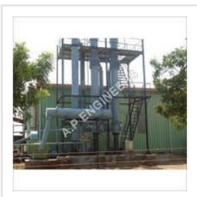
Heat Recovery Evaporators