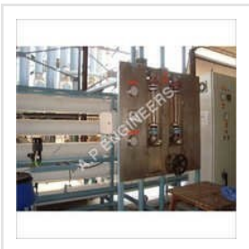
Industrial Reverse Osmosis Plant