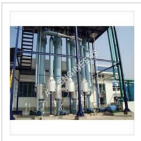
Falling Film Evaporators