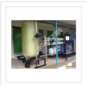
Drinking Water RO Plant