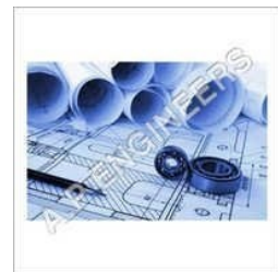
ENGINEERING CONSULTANCY SERVICES