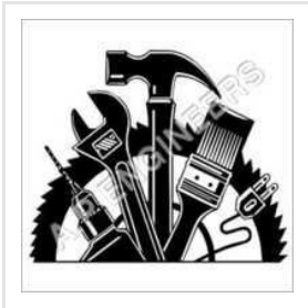
Plant Recondition Services