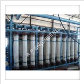
Ultra Filtration System