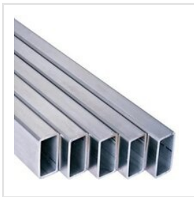
Stainless Steel Pipe Rec