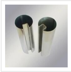
Stainless Steel Slot Pipe