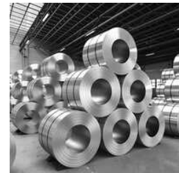
STAINLESS STEEL PLAIN COIL