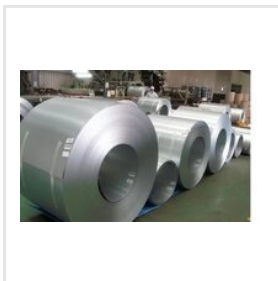
Stainless Steel Strip