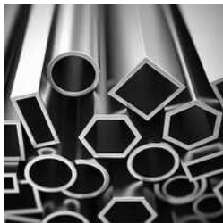
STAINLESS STEEL CONSTRUCTION PIPE

202 Stainless Steel Pipe, 304 Stainless Steel Pipe, 304 Stainless Steel Round Bar, Cold Rolled Stainless Steel Flat Bar, L Shape Stainless Steel Angle, Round Bar, SS 304 Angle, SS Flange, SS Rod, Stainless Steel Angle 202, Stainless Steel Baluster, Stainless Steel Bars, Stainless Steel Circle, Stainless Steel Circle 304, Stainless Steel Coil, etc.