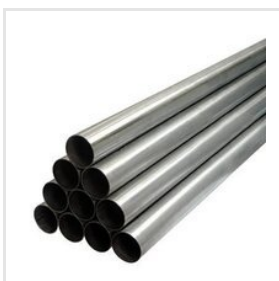
304 Stainless Steel Pipe