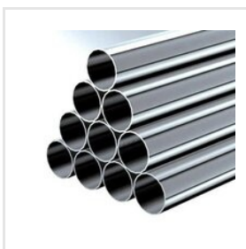
202 Stainless Steel Pipe