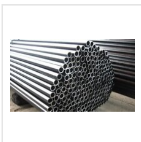
Stainless Steel Erw Pipe