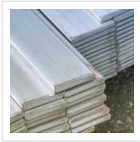
Cold Rolled Stainless Steel Flat Bar