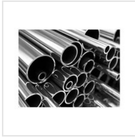
Stainless Steel Round