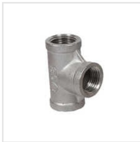
Stainless Steel Tee Fitting