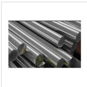
304 Stainless Steel Round Bar