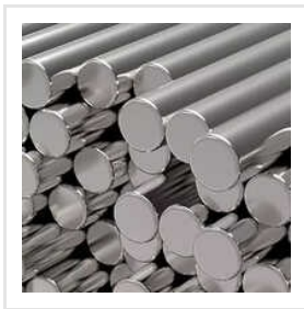
Stainless Steel Round Bar