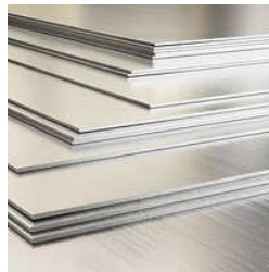
STAINLESS STEEL PLAIN SHEETS