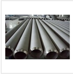
Stainless Steel Seamless Pipe