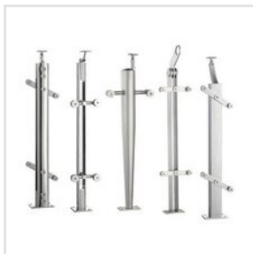
Stainless Steel Baluster