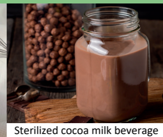
Sterilized cocoa milk beverage