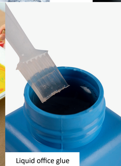
Liquid office glue