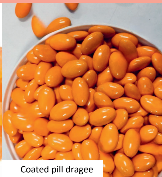
Coated pill dragee