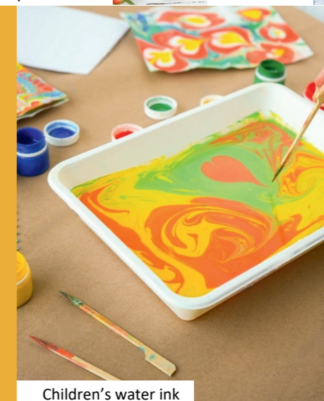
Children's water ink