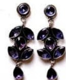
Sapphire Gemstone Designer Earrings