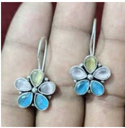
Multi Color Hook Earrings