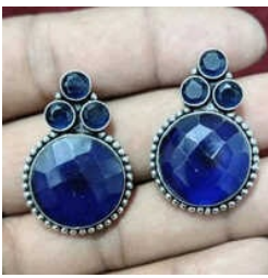
Checker Cut Round Earrings