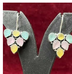
Multicolor Pear Earrings