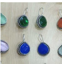
Gemstone Hanging Earrings