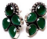
Emerald Gemstone Flower Earrings