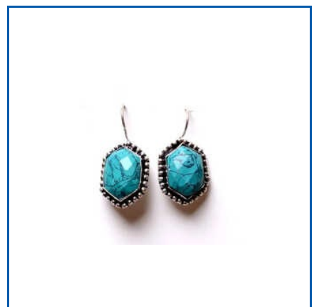
TURQUOISE GEMSTONE DESIGNER EARRINGS