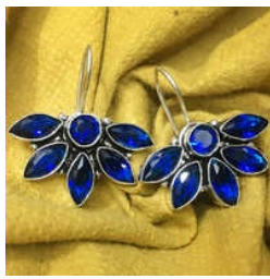
Oxidized Stone Flora Earrings