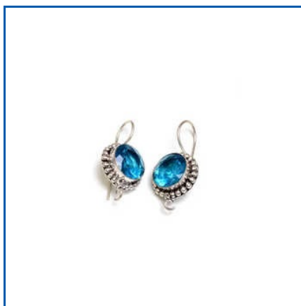
BLUE TOPAZ GEMSTONE SILVER PLATED WOMEN DANGLE EARRINGS