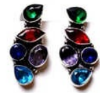
Multi Gemstone Designer Earrings