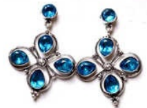
Blue Topaz Gemstone Designer Earrings