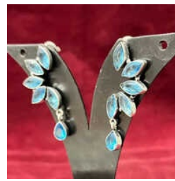
Oxidized German Silver Half Moon Design