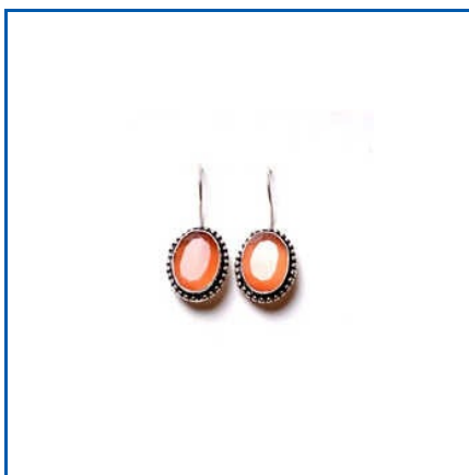
MONALISHA GEMSTONE DESIGNER EARRINGS

92.5 Silver Plated Amethyst Quartz Ring, 92.5 Silver Plated Multi Color Monalisa Stone Ring, 925 Plated Silver Look Alike Brass Bracelet Beautiful Green Color Cut Stone Bracelet, 925 Silver Plated Brass Metal Quartz Gemstone Ring, 925 Silver Plated German Silver Quartz Ring, etc.