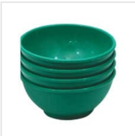
Plastic Chinese Bowl