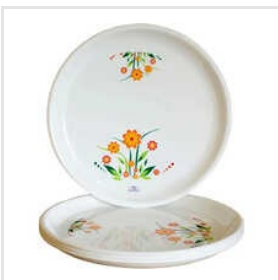
Plain Plastic Dinner Plate