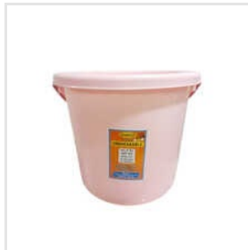
13 Ltr Pink Unbreakable Strong Plastic