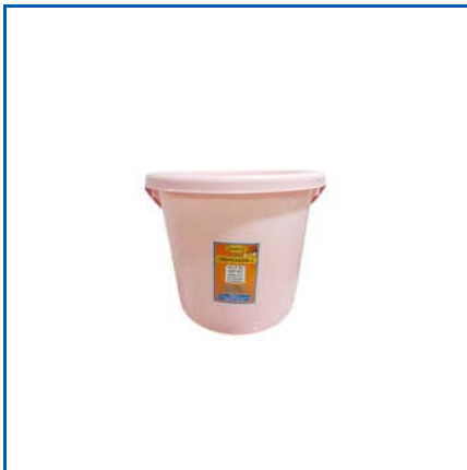
16 LTR VIRGIN PLASTIC BUCKET

1 KG Plastic Milky Printed Container, 1 KG Round Plastic Container, 10 Inch Plastic Square Flower Pot, 10 Ltr Plastic Dustbin With Lid, 10 Ltr Plastic Open Dustbin, 10 MM Plastic Drum Cap, 12 Inch Square Plastic Nursery Flower Pot, 12 Ltr Plastic Dustbins, 12 Ltr Plastic Swing Dustbin, etc.