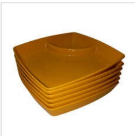
Plain Plastic Sandwich Plate