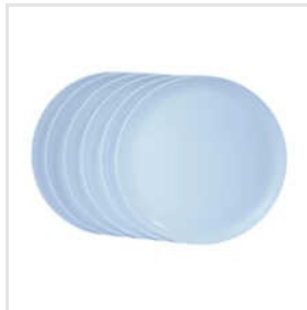
Plastic Round Dinner Plates