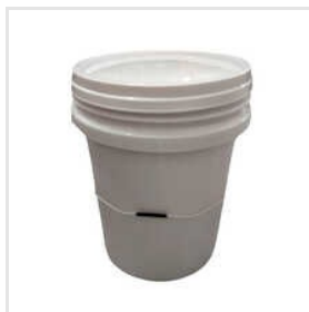
Plastic Paint Bucket