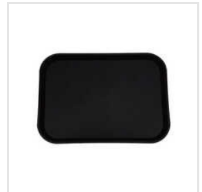
Black Plastic Serving Tray