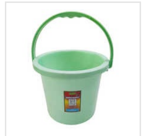
Plastic Water Bucket