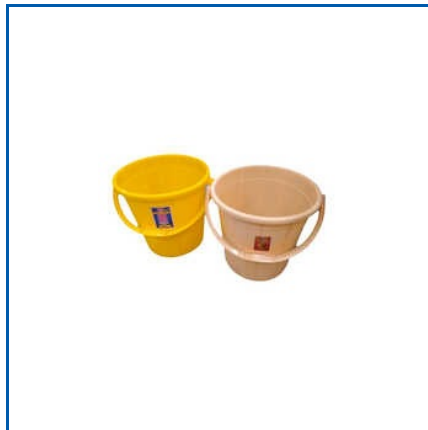
25 LTR PLASTIC WATER BUCKET