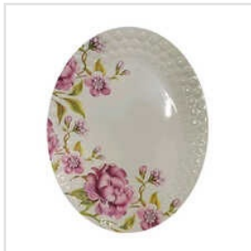
8 Inch Printed Fibre Plate