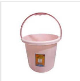
Unbreakable Plastic Bucket