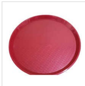
Designer Plastic Serving Tray