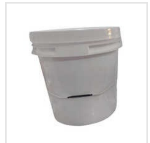
5 Ltr Plastic Dahi Bucket