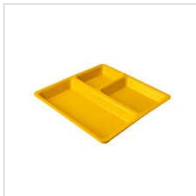
9 Inch Plastic Pav Bhaji Plate