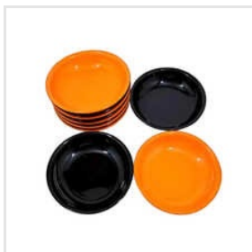
8 Inch Plastic Quarter Plates