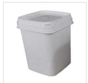
Plastic Curd Bucket