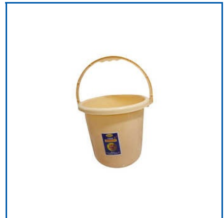
3.5 LTR WATER PLASTIC BUCKET