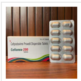
Cefpodoximke Proxetil Dispersible Tablets