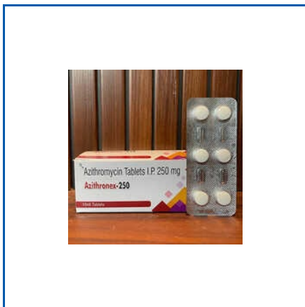
250MG AZITHROMYCIN TABLETS