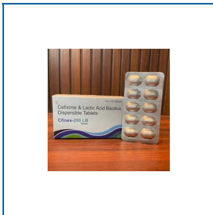
CEFIXIME AND LACTIC ACID BACILUS DISPERSIBLE TABLETS

100ml Herbal Cough Syrup, 200ml Ayurvedic Liver Tonic, 200ml Ayurvedic Stone Remover Syrup, 200ml Herbal Blood Purifier Tonic, 250mg Azithromycin Tablets, 250mg Paracetamol Paediatric Oral Suspension IP, 4mg Ondansetron Orally Disintegrating Tablets IP, 500mg Azithromycin Tablets, 5mg Levocetirizine Dihydrochloride Tablets IP, 60ml Pain Oil, etc.