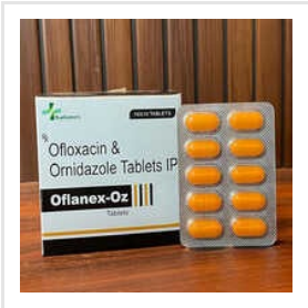
Ofloxacin And Ornidazole Tablets IP