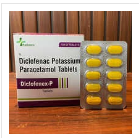
Diclofenac Pottasium Paracetamol Tablets