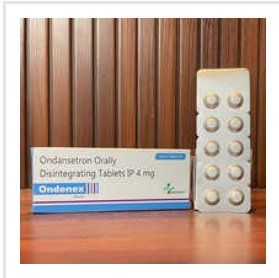
4mg Ondansetron Orally Disintegrating