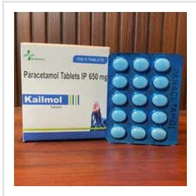
650mg Paracetamol Tablets