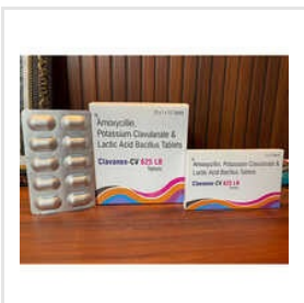
Amoxicillin Potassium Clavulanate And Lactic