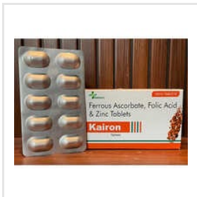
Ferrous Ascorbate Folic Acid And Zinc Tablets