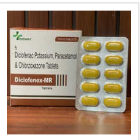
Diclofenac Pottasium Paracetamol And