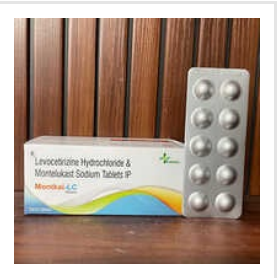
Levocetirizine Hydrochloride And