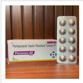
Pantoprazole Gastro Resistant Tablets IP