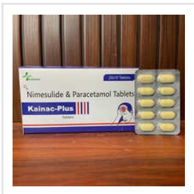
Nimesulide And Paracetamol Tablets