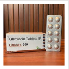
Ofloxacin Tablets IP