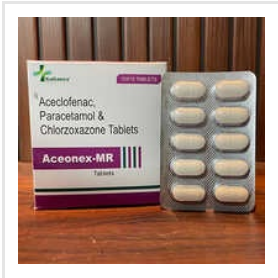
Aceclofenac Paracetamol And