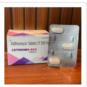
500mg Azithromycin Tablets