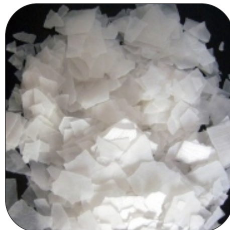
Sodium Hydroxide Flakes