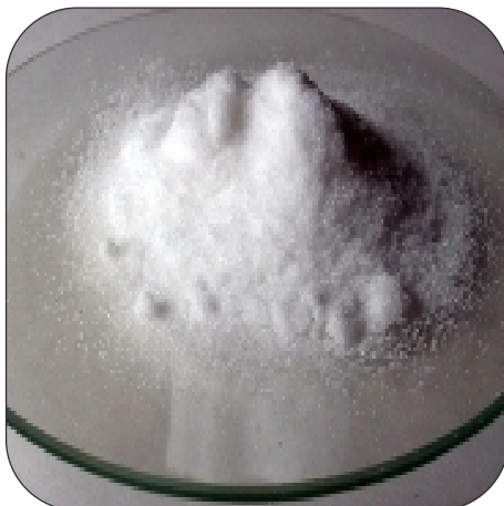
Calcium Nitrate Tetrahydrate