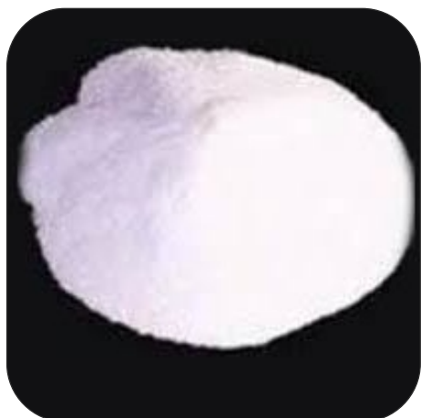
Potassium Tetra Borate