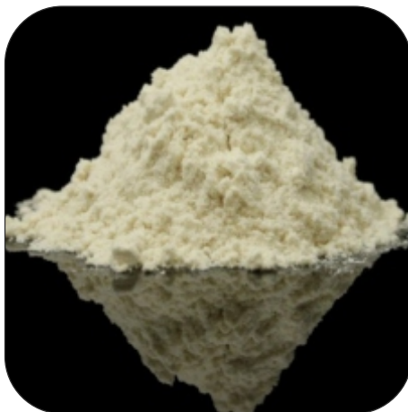
Gum Locust Bean