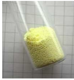
Sodium Peroxide Granular