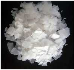
Sodium Hydroxide Flakes