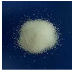
Sodium Bisulphate Monohydrate EP