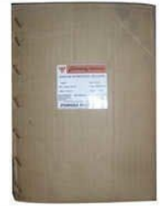
Sodium Hydroxide Pellets