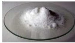
Calcium Nitrate Tetrahydrate