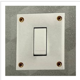
16 Amp Switch