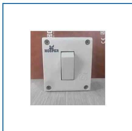
16 A SWITCH + BOX PC HOSPER

10 A Kit Kat Fuse PC Hosper, 12 M Plate Mod Indi, 16 A 2 Way Switch, 16 A Combined + Box PC Hosper, 16 A Combined + Box V Hosper, 16 A Combined V Hosper, 16 A Socket PC Hosper, 16 A Socket V Hosper, 16 A Switch + Box PC Hosper, 16 A Switch PC Hopser, 16 A Switch V Hosper, 16 AMP 5 PIN Multi Plug, 16 Amp Combined, 16 Amp Socket, 16 Amp Switch, etc.