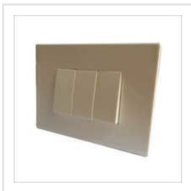
Clark's Modular Switches