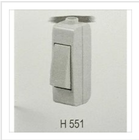
Hanging Bed Switch