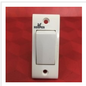
6 A Switch S1 PC Hosper