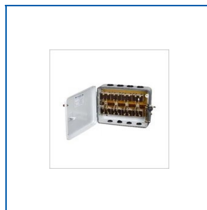
CHANGE OVER SWITCH