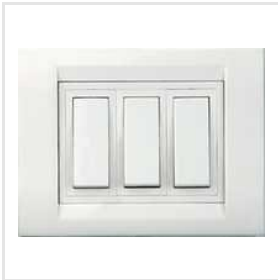
Modular Electrical Switches