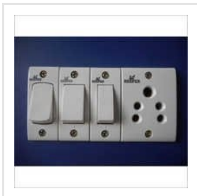
Poly Carbonate Switches