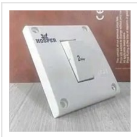
16 A 2 Way Switch