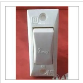
6 A 2 W Switch S1 V Hosper