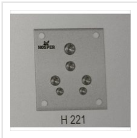
16 Amp Socket