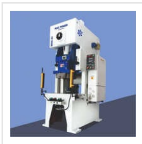
MNX 110 Cross Shaft Power Press Machine