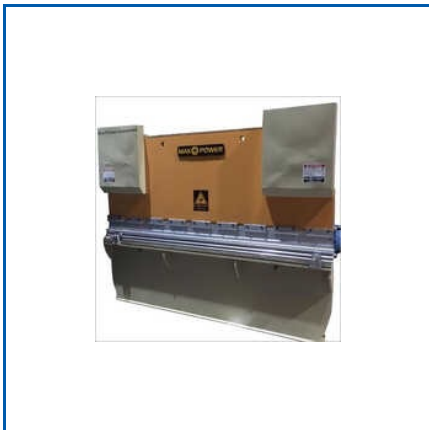
MECHANICAL SHEARING MACHINE

10 Ton C Type Power Press Machine, 10 Ton To 250 Ton Mechanical Power Press Machine, 150 Ton C Type Power Press Machine, 20 Ton C Type Hydraulic Press Machine, 25 Ton Mechanical Press Brake Machine, 250 Ton C Type Power Press Machine, 30 Ton C Type Power Press Machine, 30 Ton Single Action Power Press Brake Machine, 45 Ton Cross Shaft Power Press Machine, 50 Ton C Type Power Press Machine, 50 Ton Pillar Type Power Press Machine, 65 Ton Mechanical Press Brake Machine, 75 Ton Pillar Type Power Press Machine, 80 Ton Mechanical Press Brake Machine, Automatic Mechanical Press Brake Machine, etc.