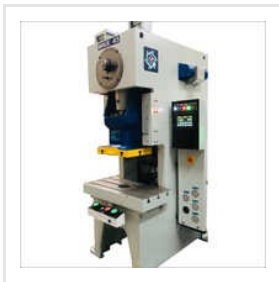
45 Ton Cross Shaft Power Press Machine