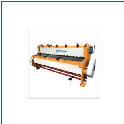
MECHANICAL UNDERCRANK SHEARING MACHINE