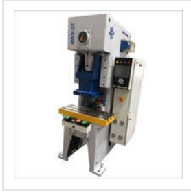
MNX 25 Cross Shaft Power Press Machine