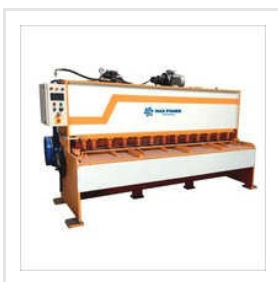
Hydraulic Guillotine Shearing Machine