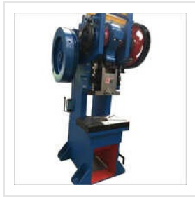
150 Ton C Type Power Press Machine