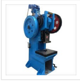
250 Ton C Type Power Press Machine