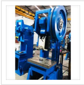
Ung geared Power Press Machine