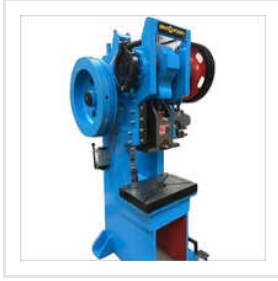
Industrial C Frame Press Machine