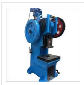
50 Ton C Type Power Press Machine