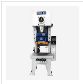
Pneumatic Cross Shaft Power Press