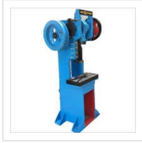
10 Ton C Type Power Press Machine