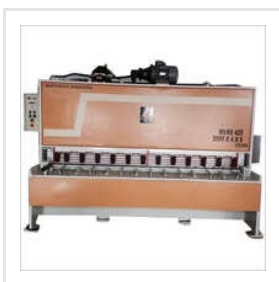
Power Shearing Machine