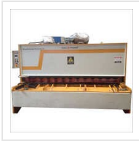
Automatic Shearing Machine