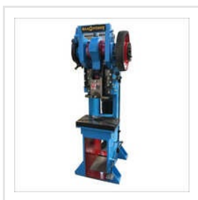
10 Ton To 250 Ton Mechanical Power