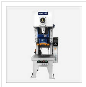
MNX 63 Cross Shaft Power Press Machine