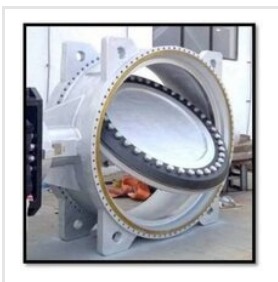
RETAINER RING 76 INCHES