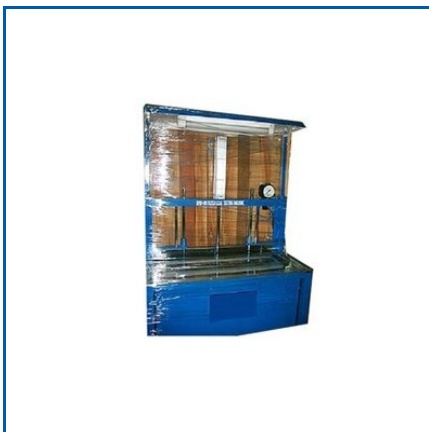
LEAKEGE TESTING MACHINE

Ball Valve Stem, Bearing Bush Press Special Purpose Machine, Bottom Plate, Cast Parts Machining Fixtures, Diesel Engine Connecting Rod Machining Fixtures, Driving Pin, Engine Block Machining Fixtures, Fire Safe Retainer Ring, Gland Flange, Hydraulic Power Pack, Industrial Inspection Gauges, Inspection Gauges, Inspection Gauges Fixture, Manifolds Machining Fixtures, Mounting Plate, etc.