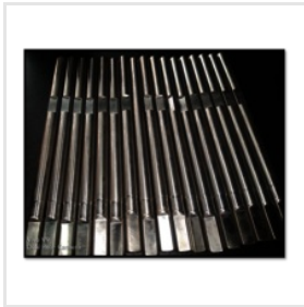
STEM WITH SLOT AND DOUBLE D