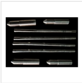
STEMS UPPER Or LOWER