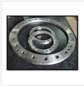
Triple Offset Retainer Ring