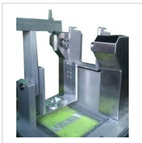
Sub-Assyly For 3D Printer Renishaw