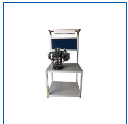
ROTATING TYPE FRONT COVER INSPECTION FIXTURE