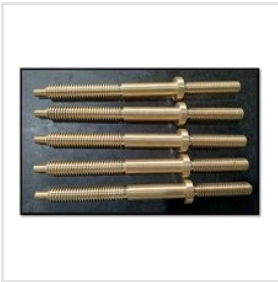
STEM FOR NAVAL VALVE NES 833 Material