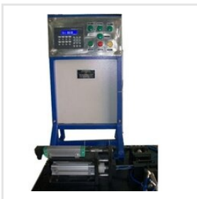
Rocker Shaft Oil Hole Checking SPM