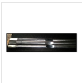
STEM WITH RADIUS AND DOUBLE D