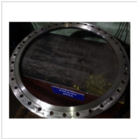
Double Offset Retainer Rings