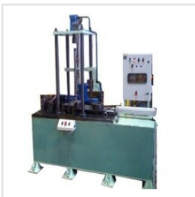
Bearing Bush Press SPM