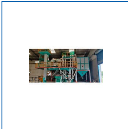
WHEAT CLEANING PLANT