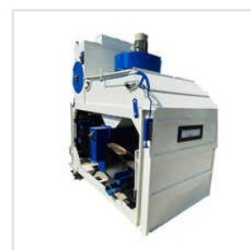
John Flour Pre-Cleaner