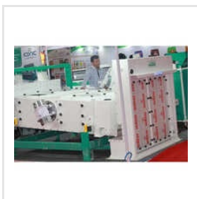
Vibro Classifier MTRA Separator