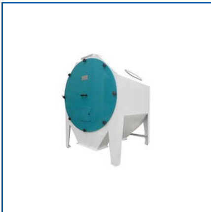
DRUM SIEVE MACHINE

Air Lock, Aspiration Box, Aspiration Channel, Atta Chakki Machine, Atta Chakki Plant, Blower Fan, Bucket Elevator, C-Type Bucket Elevator, Cattle Feed Plant, Centrifugal Sifter Machine, Classifier Separator, Cocoa Beans Processing Plant, Cumin Seed Cleaning Plant, Cyclone Separator, Drum Sieve Machine, etc.