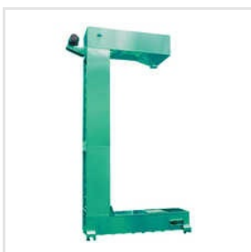
C-Type Bucket Elevator