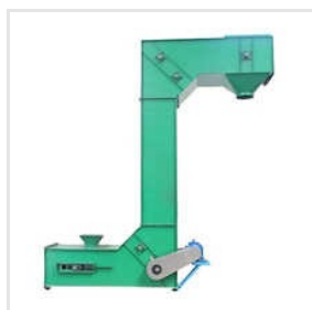
Z-Type Bucket Elevator