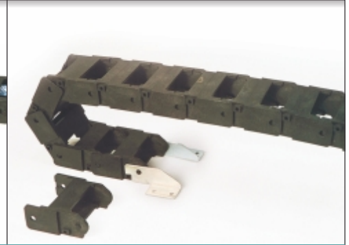
DC 5 (80x32)