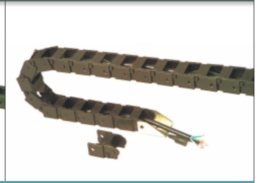
DC 2 (28x18)