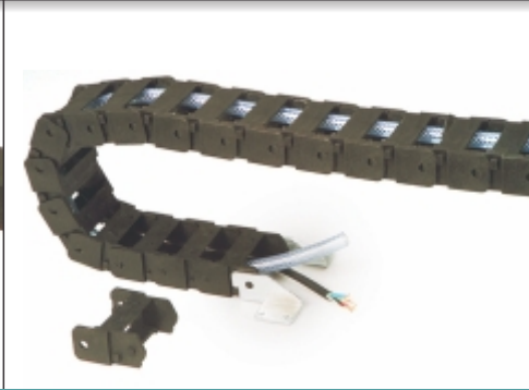
DC 4 (58x24)