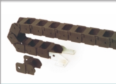
DC 3 (38x24)