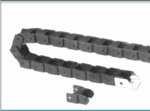
DC 0 (15x10)