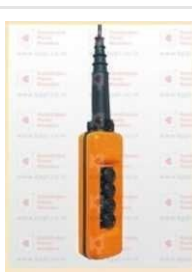
Crane Pendant Station