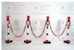
Plastic Chain Stand Poles