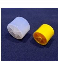
GRAVITY ROLLERS FOR TRACK