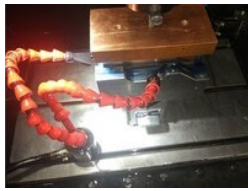
Plastic Flexible Coolant Pipes