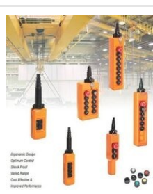
Pendant Control Station - 2Way