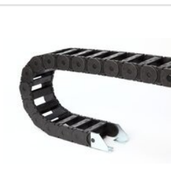
Industrial Cable Drag Chain