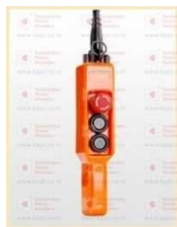
Pendants Push Button Control Station