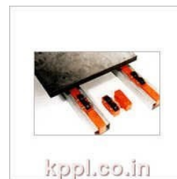
MACHINE HANDLES TOOLS