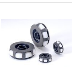
MULTI DIRECTIONAL WHEELS