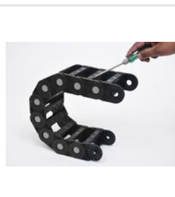
Drag Chain With Removable Width Links