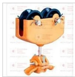
Cable Carrier Assembly