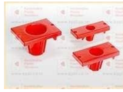
Plastic Tool Pockets