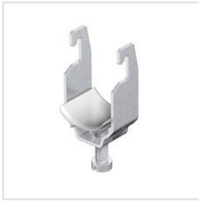
Cable Clamp Type N