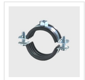
Geyser Hanging Clamp