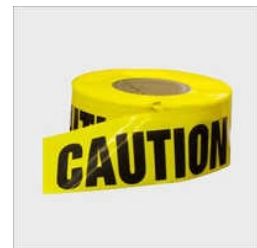
CABLE AND CONDUIT PROTECTION