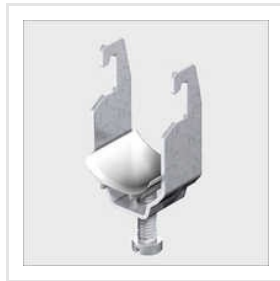
Cable Clamps And Pipe Clamps