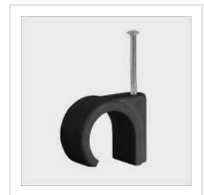
Cable Clip With Nail