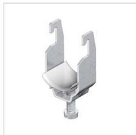
Cable Clamps Type F