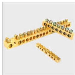
ACTIVE AND NEUTRAL LINK