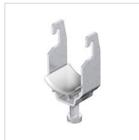
Cable Clamp U Type