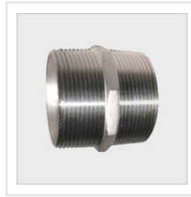
Nipples (Outer Treads)