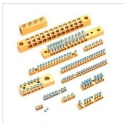
TERMINAL BRASS NEUTRAL LINKS

A1-A2 Cable Glands, Active and Neutral Link, Ball and Socket, Brass Cable Clip, CW Cable Glands (3 Parts), Cable Bar Saddle, Cable Clamp Type N, Cable Clamp U Type, Cable Clamps Type F, Cable Clamps and Pipe Clamps, Cable Clip with Nail, Cable Saddle, Cable and Conduit Protection, Cable lugs, Channel Clamps, etc.