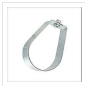
Pipe Support Sprinkler Clamps