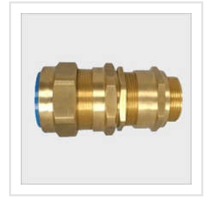
EIW Cable Glands