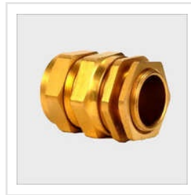
CW Cable Glands (3 Parts)