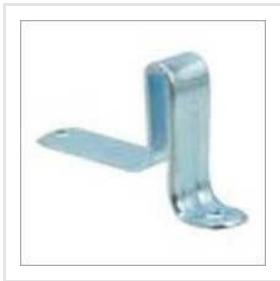
Stainless Steel Clip Steel