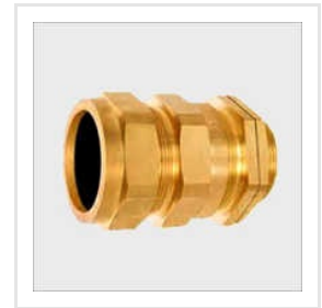
A1-A2 Cable Glands