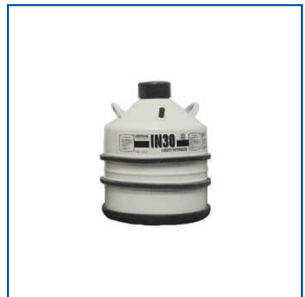
IN-30 LIQUID NITROGEN CONTAINER