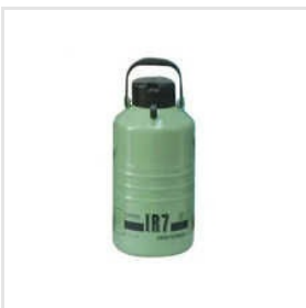
IR - 7 Liquid Nitrogen Container