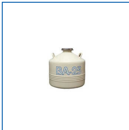
BA - 23 LIQUID NITROGEN CONTAINER