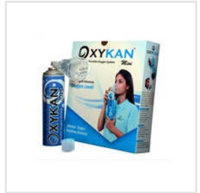
Portable Oxygen Gas