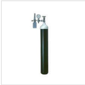
Medical Oxygen Cylinder