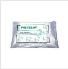
Veterinary Disposable Gloves