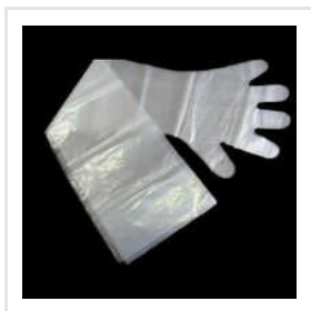
Veterinary A I Gloves