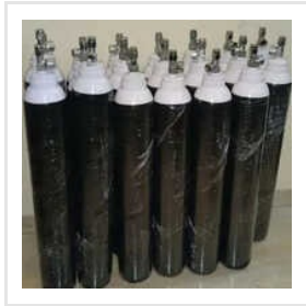
Industrial Oxygen Cylinder