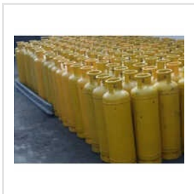
100 KG Chlorine Gas Cylinder