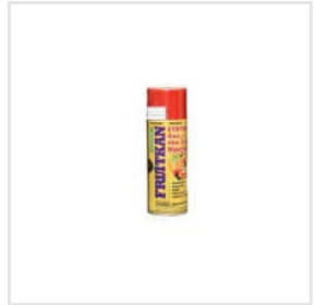
Fruit Ripening Gas Cans