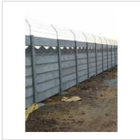
Precast Concrete Compound Wall