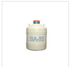
BA-35 Liquid Nitrogen Container