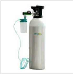
Portable Oxygen Cylinder