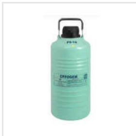
PS- 10 Liquid Nitrogen Container