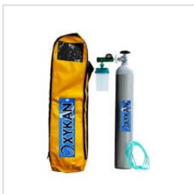
OXY 6.8 Portable Oxygen Cylinder