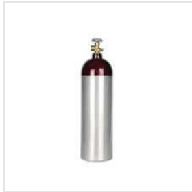
Fruit Ripening Gas Cylinder