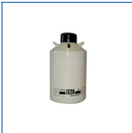
IX - 20 LIQUID NITROGEN CONTAINER

A.I. Gun, AI Sheath, Chlorination Equipment, Compressed Liquid Nitrogen Gas, Emergency Kit, Ethylene Gas, Ethylene Ripener Pouch, Frozen Semen Sample, Fruit Ripening Gas, HYCARE Gloves, IN -50 Liquid Nitrogen Container, IR - 3 Liquid Nitrogen Container, IUI Disposables, IX-2 Liquid Nitrogen Container, Industrial Gases, etc.