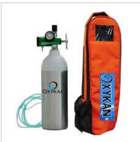
2 L Filled Portable Oxygen Cylinder Kit