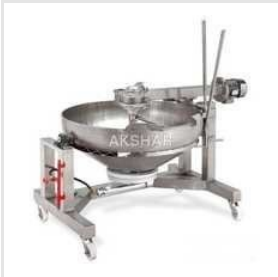
Chikki Making Machine