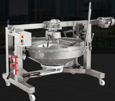
Sweets Making Machines