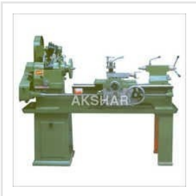
Light Duty Lathe Machine