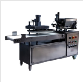
Beshan Laddu Making Machine