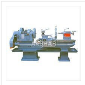
Heavy Duty Lathe Machine