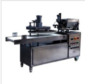
Rasgulla Making Machine