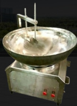
Gulab Jamun Frying Machine