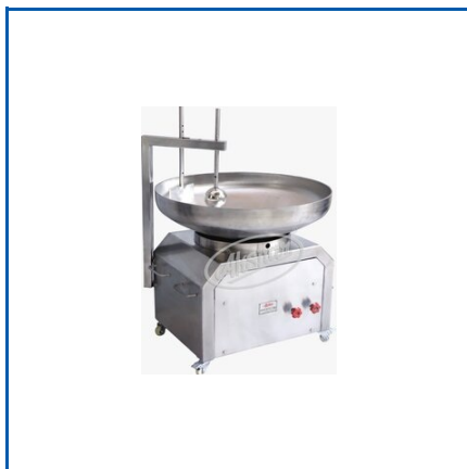
GULAB JAMUN FRYING MACHINE