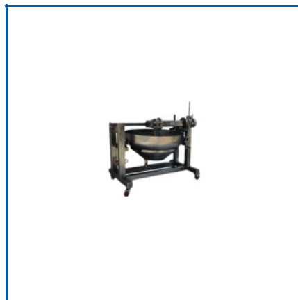
KHOYA MAKING MACHINE