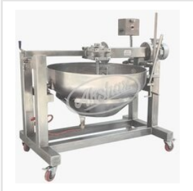
Sweets Making Machinery