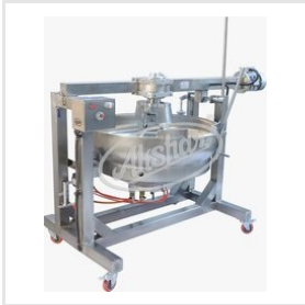
30" 6BS MAWA MACHINE