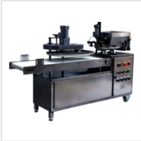
Automatic Gulab Jamun Making Machine