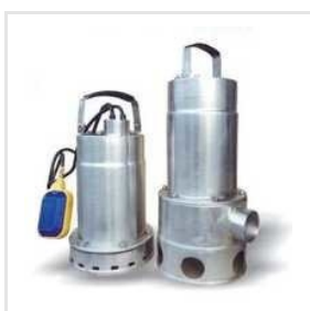
Stainless Steel Sewage Pumps