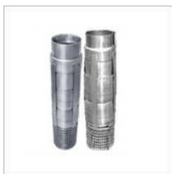
V10 Stainless Steel Borewell Submersible