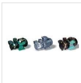
Magic Suction Pumps 2880 RPM