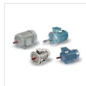
Squirrel Cage Induction Motor