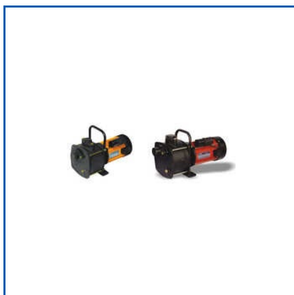
OSWAL SHALLOW WELL PUMPS