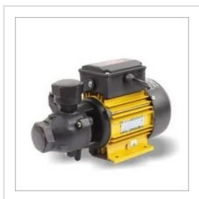
Centrifugal Regenerative Pumps