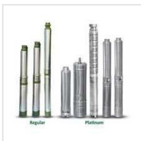
V4 Borewell Submersible Pumps