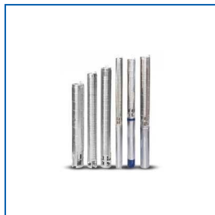
STAINLESS STEEL V4 BOREWELL SUBMERSIBLE PUMPS 100 MM