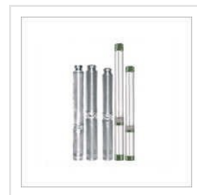
V3 Borewell Submersible Pumps