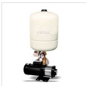
Pressure Boosting Unit