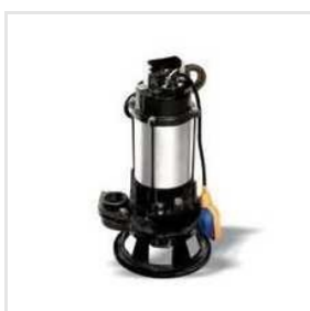
CL Sewage Pumps