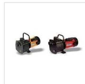
Shallow Well Pumps