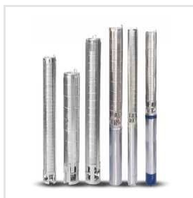
Stainless Steel V4 Borewell Submersible