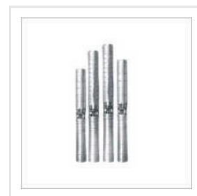
V4 Stainless Steel Borewell Submersible