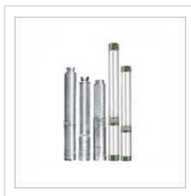
V3 Borewell Submersible Pumps