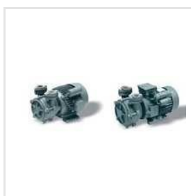
Booster Pumps 1440 RPM