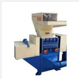
Mild Steel Plastic Scrap Grinder