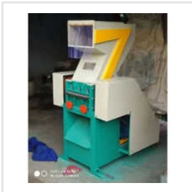
3 Hp Plastic Scrap Grinder Machine