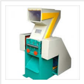
Plastic Waste Grinding Machine