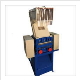
Plastic Scrap Grinding Machine