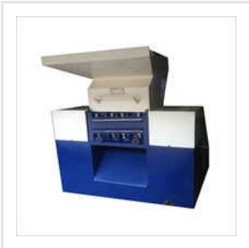
Plastic Scrap Grinder