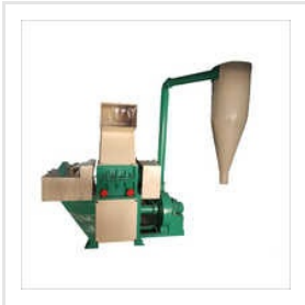
Plastic Grinding Machine