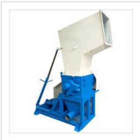
Plastic Scrap Grinder Machine