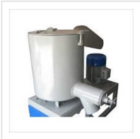
Plastic Mixer Machine