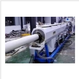
PVC Pipe Machine