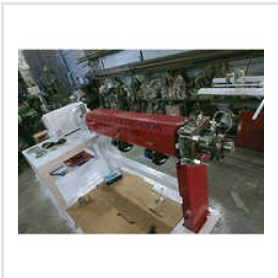
Pvc Conduit Pipe Making Machine