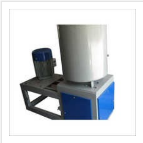
Heavy Duty Mixer Machine