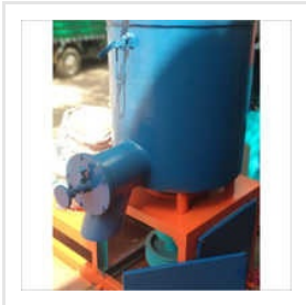
Heavy Duty Mixer Machine