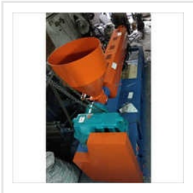
Plastic Pipe Extrusion Machine