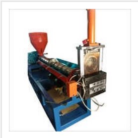
Plastic Extrusion Machine