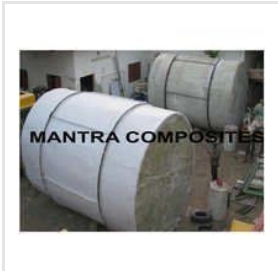
FRP Storage Tank