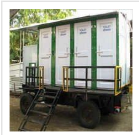
Mobile Toilet Van