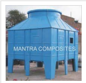
FRP Cooling Tower