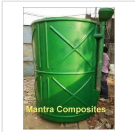
Bio Gas Tank