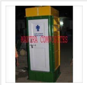
FRP Urinal Cabin