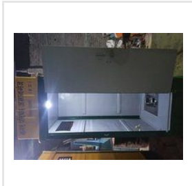
FRP Portable Toilets Cabin