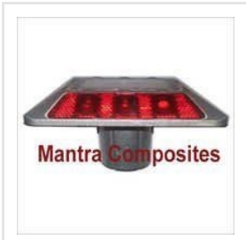
Solar Stud Side