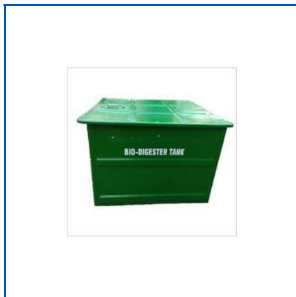
BIO DIGESTER SEPTIC TANK