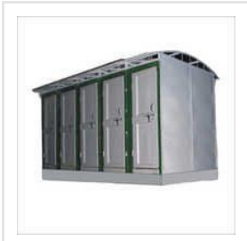
Prifab Toilet Cabin