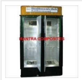
FRP Double Toilet Block