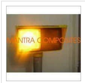
Solar Alternet Blinker