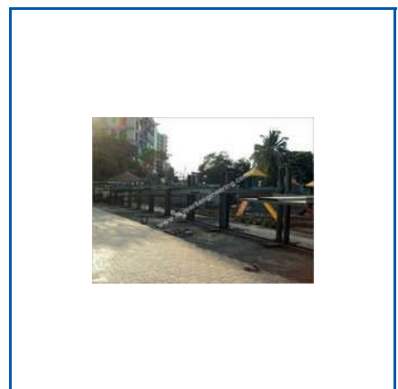
VERTICAL TOWER CAR PARKING SYSTEM