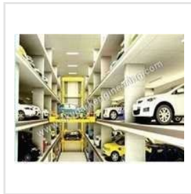
Elevator Parking System