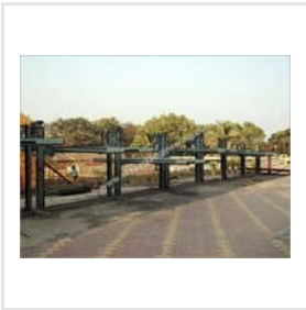
Stack Parking System