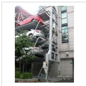
Vertical Building Parking System