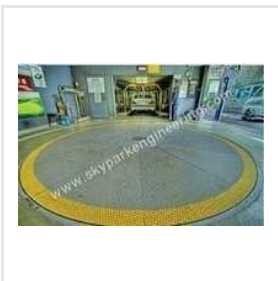
Rotary Table Parking System