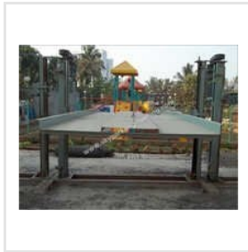
Automated Puzzle Car Parking System