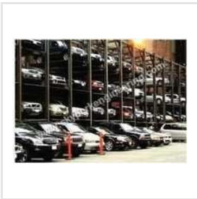
Multi Car Parking System