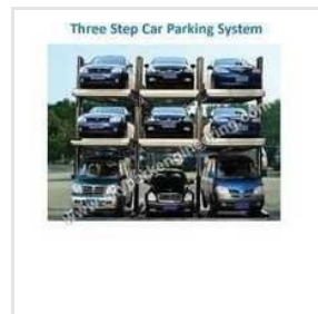
Three Step Parking System