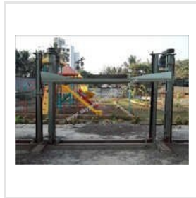
Automated Rotary Car Parking System