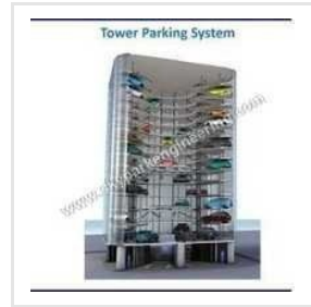
Tower Parking System