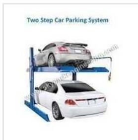
Two Step Car Parking System