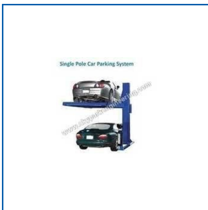
SINGLE POLE CAR PARK

Automated Puzzle Car Parking System, Automated Rotary Car Parking System, Car Parking System, Elevator Parking System, Hydraulic Car Parking System, Lapping Machine, Multi Car Parking System, Pit Car Parking System, Puzzle Car Parking System, Rotary Parking System, Rotary Table Parking System, Single Pole Car Park, Stack Car Parking System, Stack Parking System, Three Step Parking System, etc.