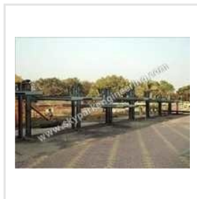
Hydraulic Car Parking System