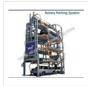
Rotary Parking System