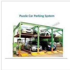
Puzzle Car Parking System