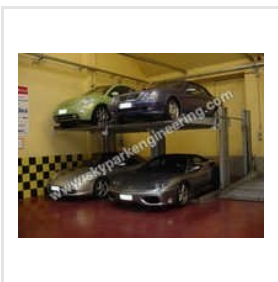
Car Parking System