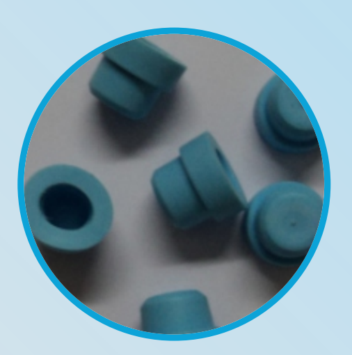
14 mm Rubber Stoppers for Blood Collection Tube