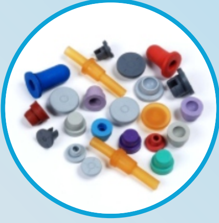
Rubber Surgical Component