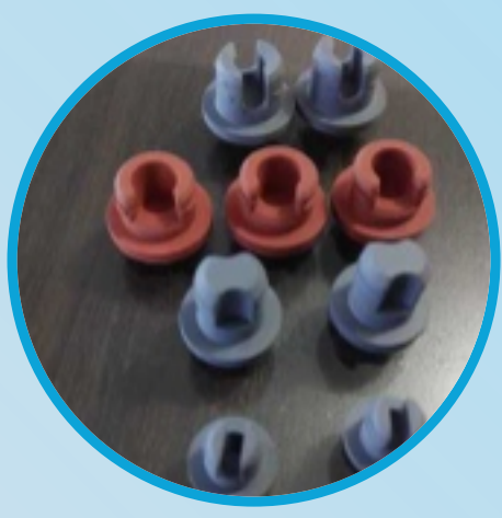
Pharma Bottle Rubber Stopper