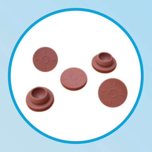
20mm Bromo Butyl Rubber Stopper