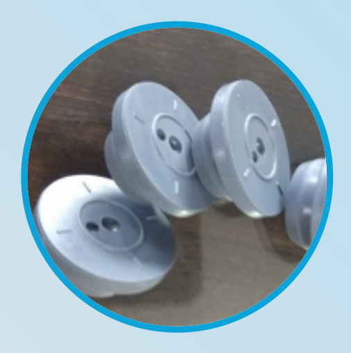
Bromo Butyl Rubber Stopper