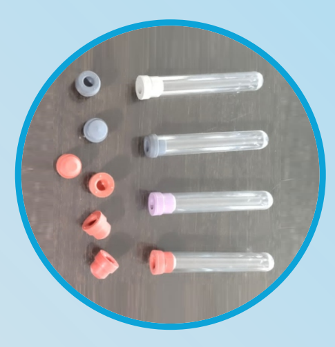
Blood Sample Tube Rubber Stopper