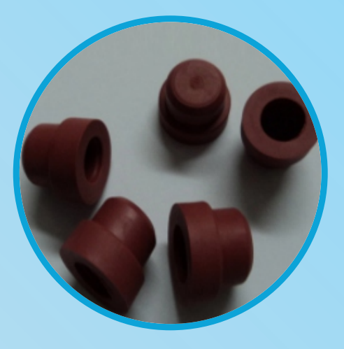
Rubber Stopper for Blood Collection Tube