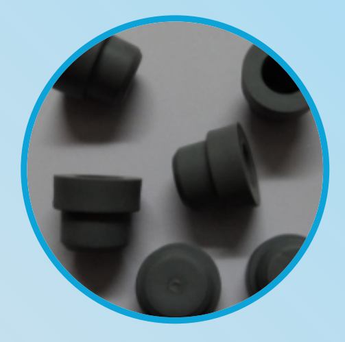
Blood Collection Tube's Stoppers