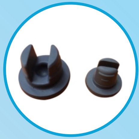
Slotted Rubber Stopper