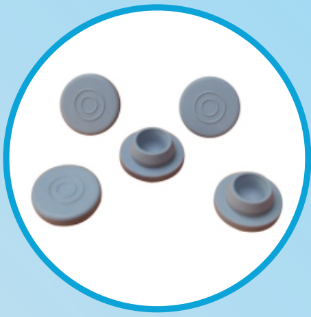
20mm Vial Rubber Stopper