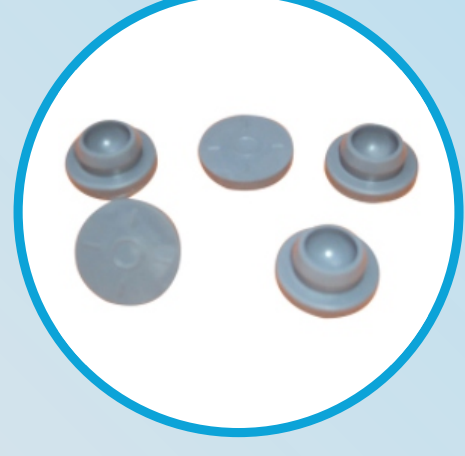
Pharmaceuticals Rubber Stoppers