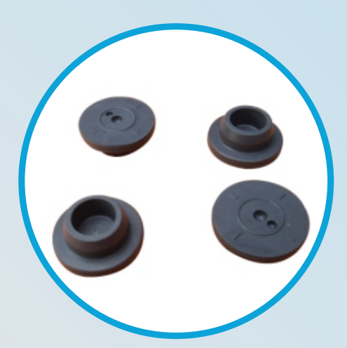
Sterilized Rubber Closures