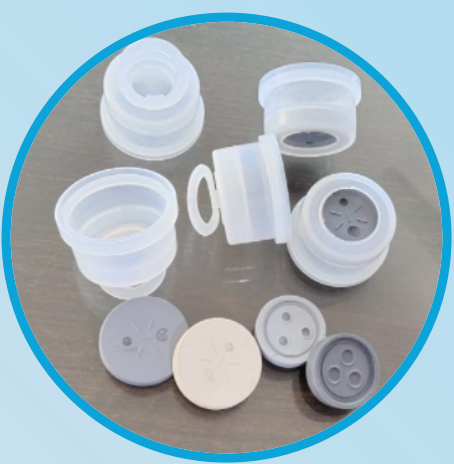
Euro Head Cap Rubber