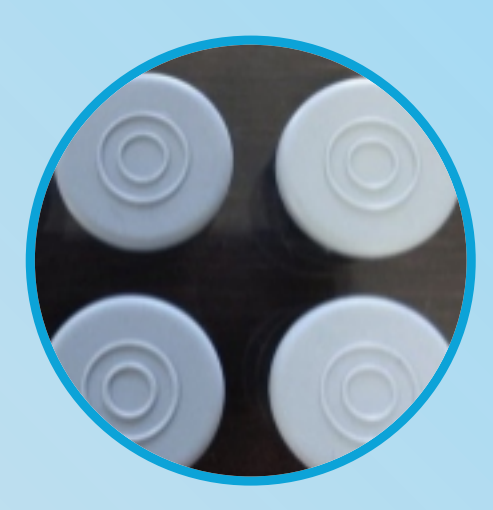
Pharmaceutical Grey Butyl Rubber Stopper