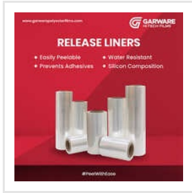
Sipet Liner (Off-Line) Sheet