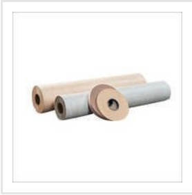
Garkon Class H