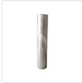
Polyester Transparent Film