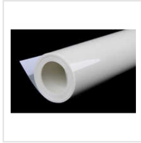
Garware Milky Polyester Film Em6