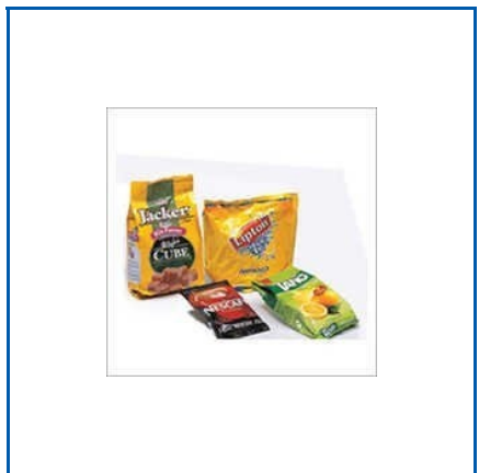
FOOD PACKAGING FILM