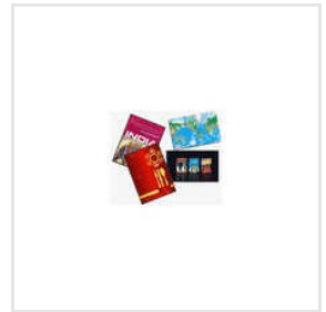
Bopp Feather Feel Thermal Films