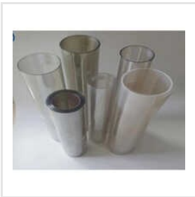
Garware Polyester Film Transparent (Clear)