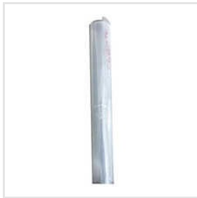
Garware Clear Polyester Film