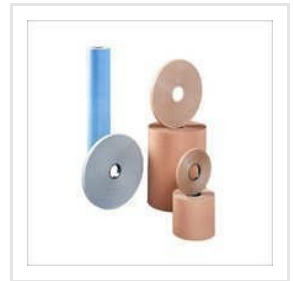
Class F Insulation