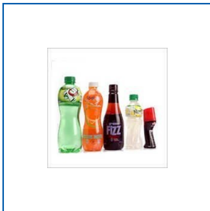
HIGH SHRINK FILM