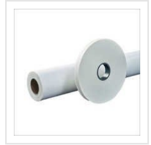
Garfeece Class B