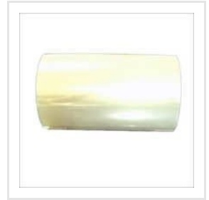
SDT Grade Siliconised Polyester Film Liner