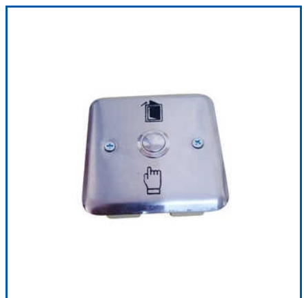
MULTI DOOR INTERLOCKING SYSTEM