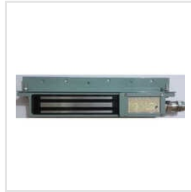
Flameproof Pass Box Electro Magnetic Locks