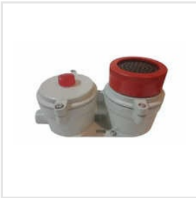
Flameproof Hooter With Flasher