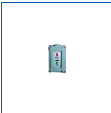
240 V ELECTRONIC INTERLOCKING SYSTEM