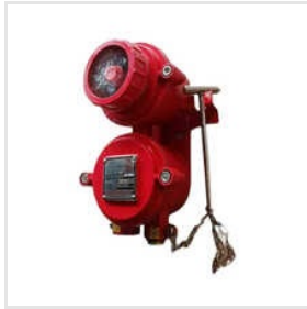
Red Flameproof Manual Call Point