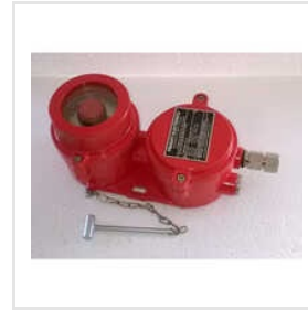
Flameproof Manual Call Point