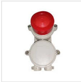
Junction Box FLP Hooter