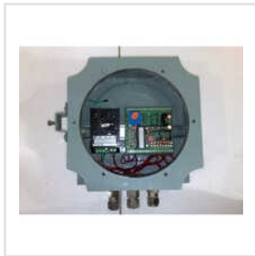
Flameproof Door Interlocking System