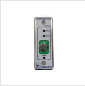
PB-SS-2 Pass Box Interlock System