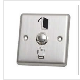
Door Interlock System