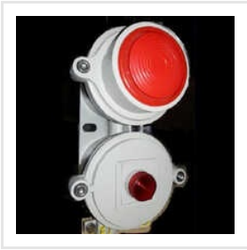
Wall Mounted Fire Alarm Hooter