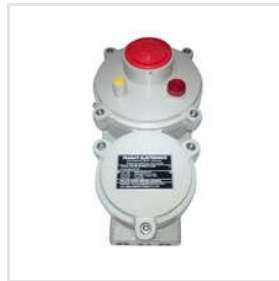
Flameproof Hooter With Acknowledgment