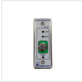
12 VDC Pass Box Interlock System