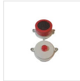
MS Fire Alarm Hooter