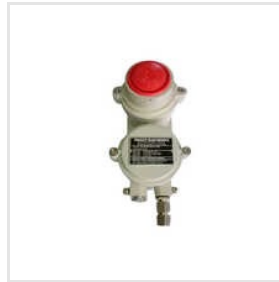
Flameproof Hooter With Flasher