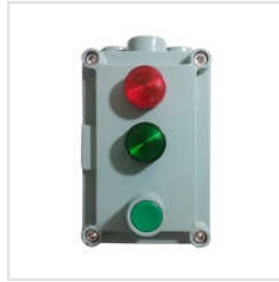
24 VDC Flameproof Pass Box Interlock