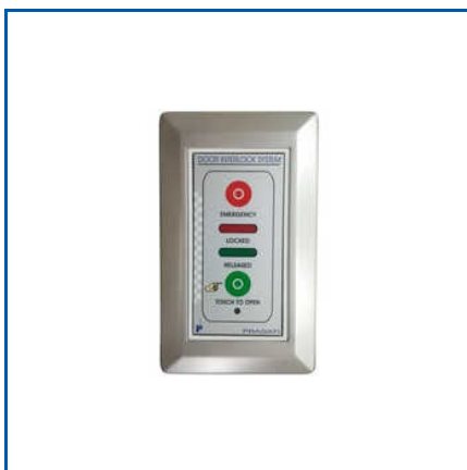
ELECTRONIC DOOR INTERLOCKING SYSTEM

Biometric Reader, Door Interlock Switches, Door Interlock System, Drop Bolt Lock, Electro Magnetic Locks, Electromagnets, Flameproof Digital Clock, Flameproof Door Interlock System, Flameproof Electrical Fittings, Flameproof Electro Magnets, Flameproof Hooter, Flameproof Hooter with Acknowledgment, Flameproof Hooter with Flasher, Flameproof Manual Call Point, Flameproof Pass Box Interlock System, etc.