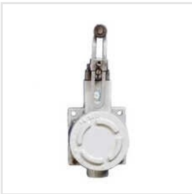
Flameproof Limit Switch