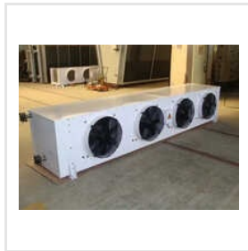
Ammonia Blast Freezer Evaporators