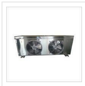
Cold Room Evaporator