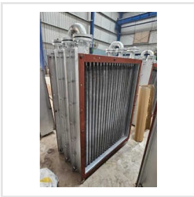
Industrial Steam Radiator