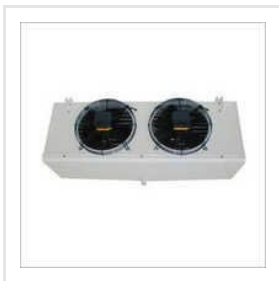
Cold Room Evaporator Unit