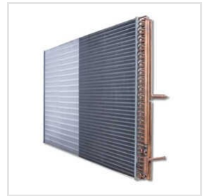
Chilled Water AHU Coil.