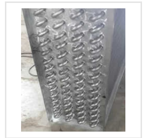
SS Tube Heating AHU Coil