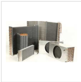
Heat Transfer AHU Coil