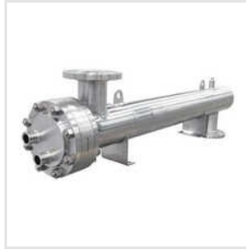
SS Tube Heat Exchangers