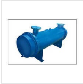
Cooper Oil Cooler