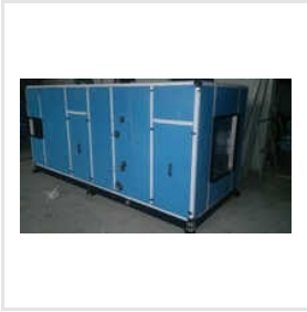
Double Skin Air Handling Unit