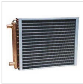
Cooper Refrigeration Coils