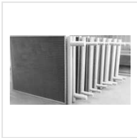
Cooper Evaporator Coil