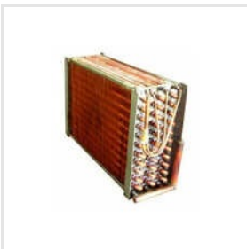
Copper Fin Cooling Coil