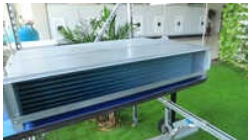
CHILLED WATER HIGH WALL FAN COIL UNITS

2 Stage Air Washer Cooler, 200 TR Shell And Tube Condensers, Air Cooled Condensers, Air Cooled Water Chillers, Air Handling Systems, Air Washer Cooler, Ammonia Air Cooling Units, Ammonia Blast Freezer Evaporators, Central Heating Panels Radiators, Chilled Water AHU Coil., Chilled water High Wall Fan Coil Units, Cold Room Evaporator, Cold Room Evaporator Unit, Cooper Evaporator Coil, Cooper Oil Cooler, etc.