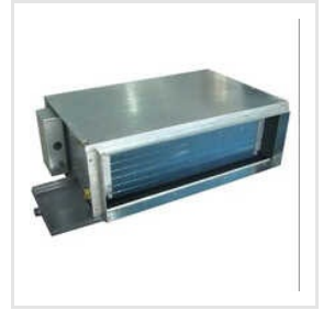
Fan Coil Unit