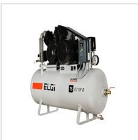
Oil Free Piston Compressors