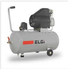
Single Stage Direct Drive Reciprocating