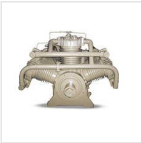
RR 100101 EC (Expressor) Diesel