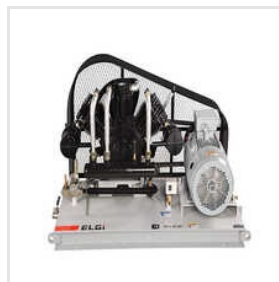
High Pressure Reciprocating