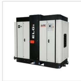
Oil Free Screw Air Compressors OF Series