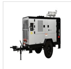
Diesel Engine Trolley Mounted Air