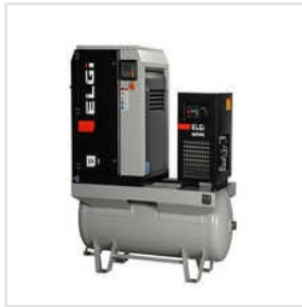
EN Series (2.2-45 KW) Screw Air Compressor