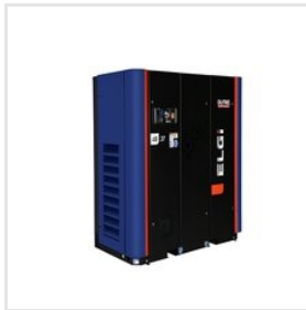
Oil Free Screw Air Compressors