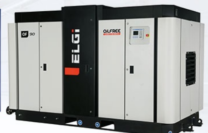
Oil Free Screw Compressors 11-450 KW

Diesel Powered Portable Air Screw Compressor, Four Post Lift, High Pressure Reciprocating Air Compressors, Horizon Electric Powered Screw Air Compressors, Horizon Reciprocating Air Compressors, HYDRAULIC HOIST, Large Electric Powered Screw Air Compressors, Lubracting Pumps, Reciprocating Compressors, Rotary Compressors – Single and Two Stage Airends, Rotary Screw Airends, Spray Paint Booths, Tandem Electric Power Screw Compressor, Two Post Lift, Tyre Changer, etc.