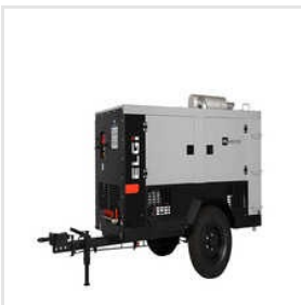
Electric Powered Trolley Screw Air