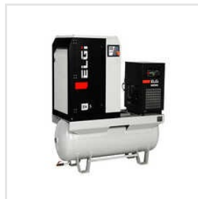
Electric Lubricated Screw Air Compressor