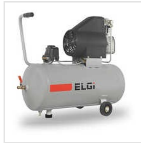
Single Stage Direct Drive Piston