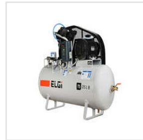
Single And Two Stage Industrial