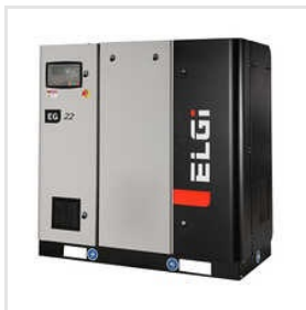
Electric Lubricated Screw Air Compressor