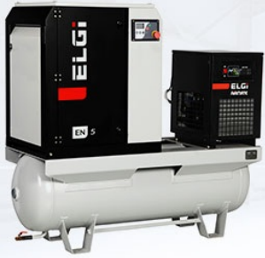
Oil Lubricated Screw Compressors 2.2-250KW