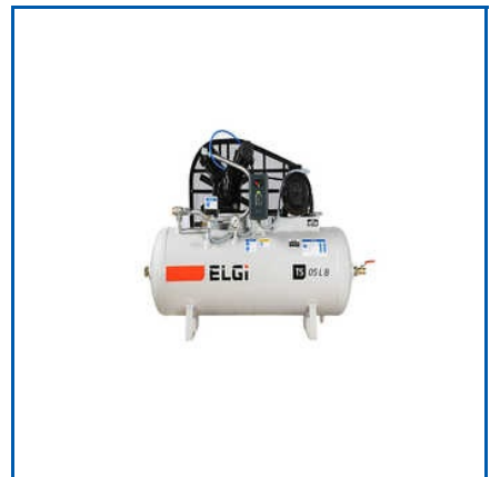
SINGLE AND TWO STAGE INDUSTRIAL PISTON COMPRESSOR