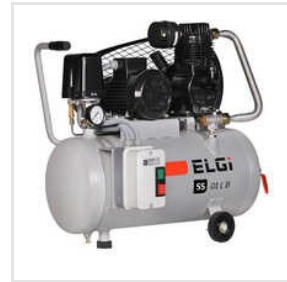
Single Stage Belt Drive Piston Compressor