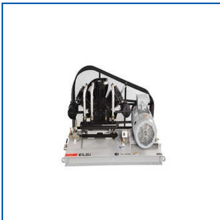
HIGH PRESSURE PISTON COMPRESSORS

Diesel Powered Portable Air Screw Compressor, Four Post Lift, High Pressure Reciprocating Air Compressors, Horizon Electric Powered Screw Air Compressors, Horizon Reciprocating Air Compressors, HYDRAULIC HOIST, Large Electric Powered Screw Air Compressors, Lubracting Pumps, Reciprocating Compressors, Rotary Compressors – Single and Two Stage Airends, Rotary Screw Airends, Spray Paint Booths, Tandem Electric Power Screw Compressor, Two Post Lift, Tyre Changer, etc.