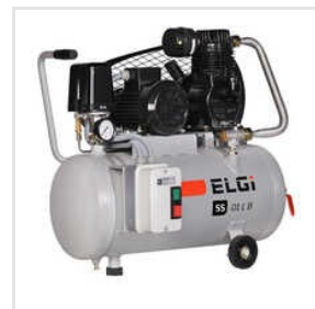
Single Stage Belt Drive Reciprocating