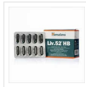
Himalaya Liv 52 HB Capsule