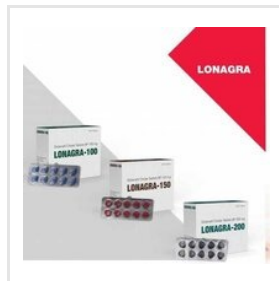
Lonagra Tablets ED