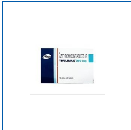
TRULIMAX AZITHROMYCIN TABLETS