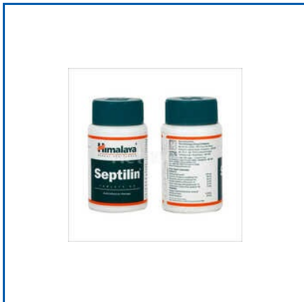
HIMALAYA SEPTILIN TABLETS

Allegra , Aciphex, Actos, Adalat, Albenza, Aldactone, Allegra Fexofenadine, Altace, Amaryl, Amaryl Glimepiride, Amoxil 500 Mg, Aricept Donepezil, Asacol Mesalamine, Atarax, Avandia, etc.