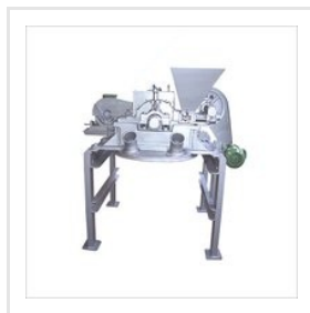
Shubh Micro Pulverizer Ms