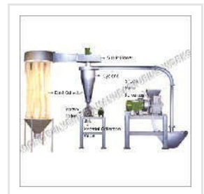
Micro Pulverizer With Pneumatic System