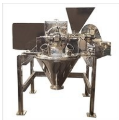
SHUBH MICRO PULVERIZER WITH BOTTOM CONE CGMP

Arrangement for Grinding Liquids and Slurries, Baby Pulverizer, Ball Mill, Ball Mill Big MICRO PULVERIZER, Centrifugal Sieving Machine, Coal Pulverizer, Crusher Micro Pulverizer, Disc Pulverizer Plastic Grinding, GMP MODEL Mini Pulverizer, Gravity Feeding Micro Pulverizer, Grinder Pre-Crusher, Jar Mill, Jar Mill Machine, Lab Ribbon Blender CGMP, Liner Micro Pulverizer, etc.