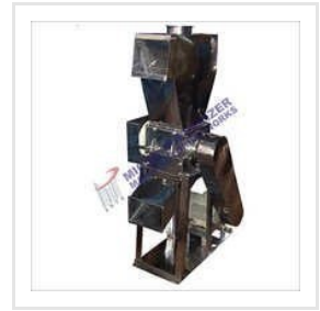
Crusher Micro Pulverizer