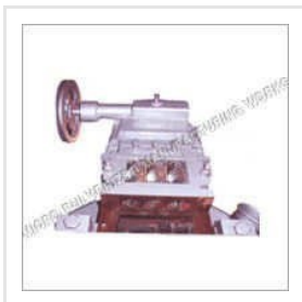
Screw Feeding Micro Pulverizer