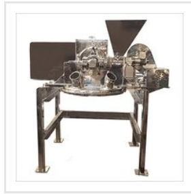
Shubh Micro Pulverizer No.2 Cgmp Model