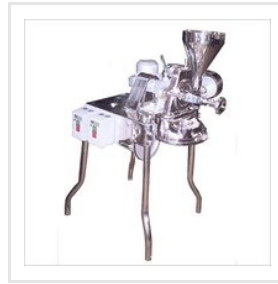
Shubh Micro Baby Pulverizer Cgmp