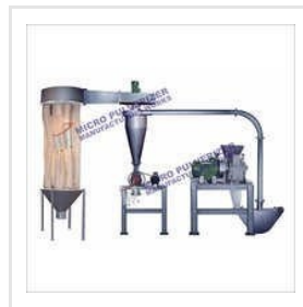
Pulverizer With Pneumatic System