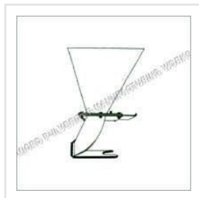
Gravity Feeding Micro Pulverizer