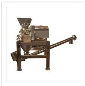
Pharmaceutical Pulverizer CGMP