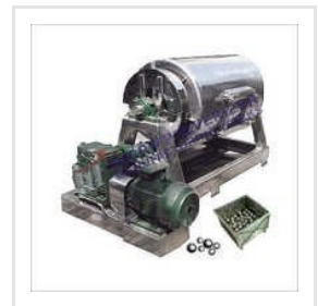
Ball Mill Big MICRO PULVERIZER