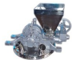
SHUBH MICRO PULVERIZER SS