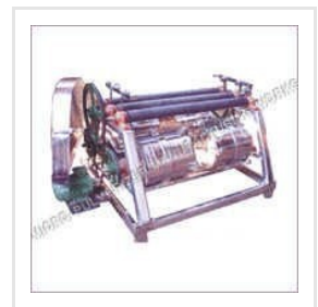
Micro Jar Mill