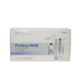
Paclitaxel NAB Tablet