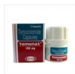
Temozolomide 100 Mg