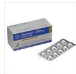
Nexavar 200 Mg