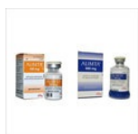
Alimta Injection Drugs