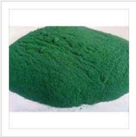
Basic Chromium Sulphate