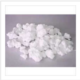
Calcium Chloride Fused Lumps