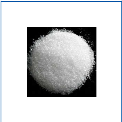
MAGNESIUM SULPHATE HEPTAHYDRATE