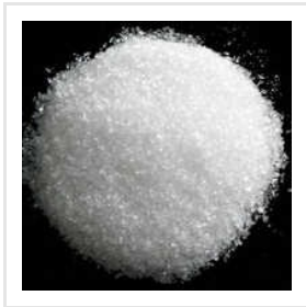
Magnesium Sulphate Heptahydrate