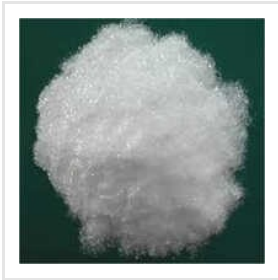
Sodium Acetate Trihydrate