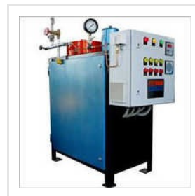
Hot Water Boilers