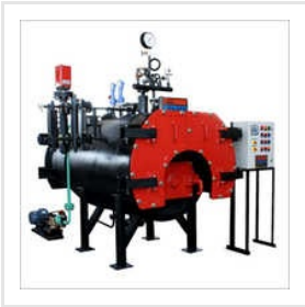
Solid Fuel Fired Steam Boilers