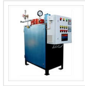
Automatic Electric Steam Boilers