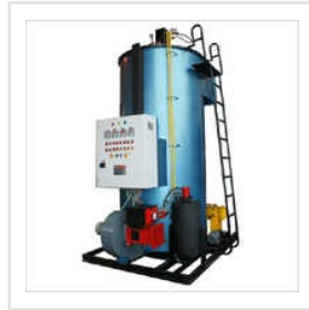
Oil Fired Thermal Fluid Heater