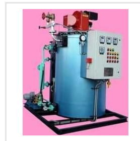
Gas Fired Steam Boilers