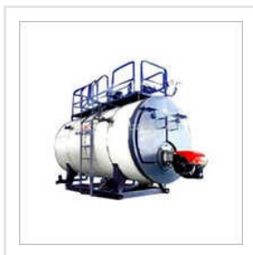
Solid Hot Water Boilers