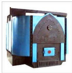
SOLID FUEL FIRED HOT AIR GENERATORS