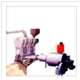
Oil Fired Hot Air Generators