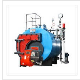
Thermax Steam Boiler