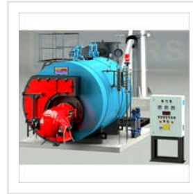
Oil Gas Fired Smoke Tube Type Steam Boiler