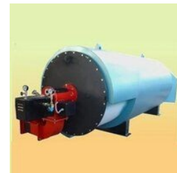
GAS FIRED HOT AIR GENERATORS