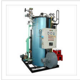
Gas Fired Smoke Tube Type Steam Boilers