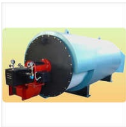
OIL AND GAS FIRED HOT AIR GENERATOR

Oil/Gas fired Hot Water generator/Heater, ELECTRIC HOT WATER GENERATOR, Electric Steam Boilers , Electric Thermal Fluid Heater, FUEL OIL PREHEATER , HEAT RECOVERY UNITS, Horizontal Steam Boiler, MOBILE STEAM GENERATOR, Oil/ Gas Fired Thermal Fluid Heater, Oil/Gas Burners, Oil/Gas fired Steam Boiler, Solid Fuel Fired Hot Water Generator / Boiler, Solid Fuel Fired Steam Boiler, Solid Fuel Fired T.F. Heater, Solid Fuel Fired Thermal fluid heater/Ganerator, etc.