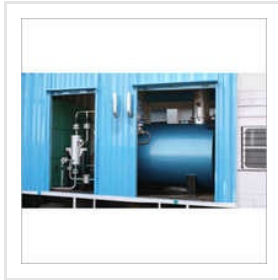
Mobile Steam Generator