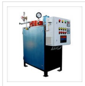
Electric Steam Boilers