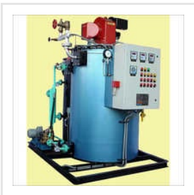
Oil Fired Steam Boilers