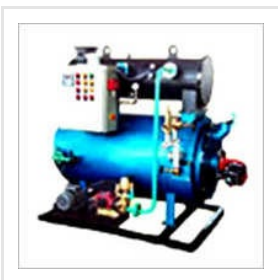
Horizontal Steam Boilers