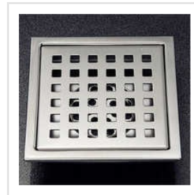
150MM Bath Floor Drainer