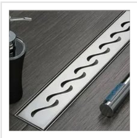
Bliss Shower Channel Drainer