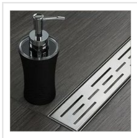
Milano Channel Drain