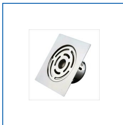
SQUARE COCKROACH TRAP