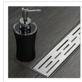
Long Shower Channel Drain