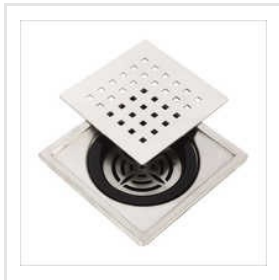
150MM Floor Grating