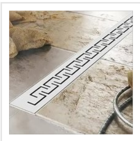
Bathroom Floor Drainer