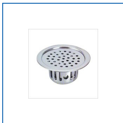
ROUND COCKROACH TRAP

150MM Anti Floor Drain, 150MM Anti Floor Grating, 150MM Anti Square Floor Drain, 150MM Anti Square Floor Grating, 150MM Bath Floor Drainer, 150MM Bath Floor Grating, 150MM Floor Grating, 150MM Long Floor Drain, 150MM Square Floor Drain, 150MM Square Floor Drainer, 150MM Square Floor Grating, 150MM Square Floor Trap, Abbey Tile In Channel Drain, Anti Cockroach Trap, Balcony Channel Drainer, etc.