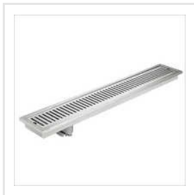
SS Shower Channel Drain