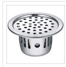
Anti Cockroach Trap