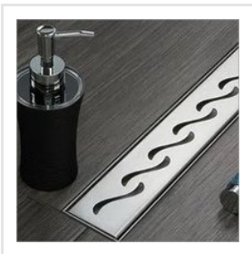
Bliss Channel Drain