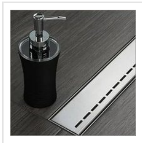
Vetro Line Channel Drain