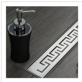
Florence Channel Drain