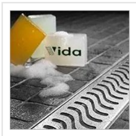
Bathroom Channel Drain