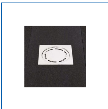
SQUARE COCKROACH TRAP CLEAN LINE