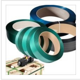
Polyester PET Strap