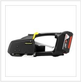
Battery Operated Strapping Tool