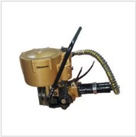
Pneumatic Steel Strapping