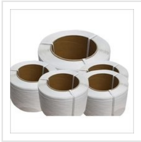
PP Box Strapping Roll