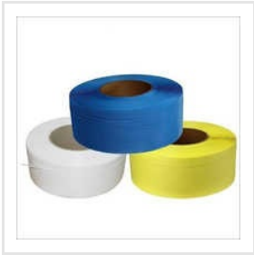
Heat Sealing Strap