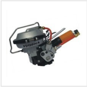
Pneumatic Sealless Combination Tool