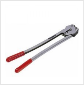
PP Strapping Sealer