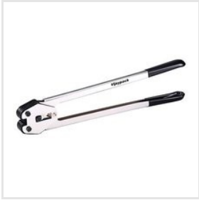
PET Strapping Sealer