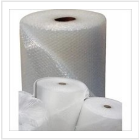
Air Bubble Film