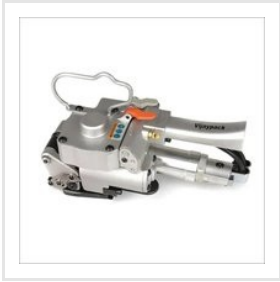
Pneumatic Strapping Tool