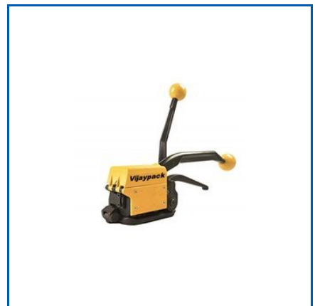
STEEL STRAPPING TOOL