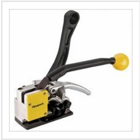
Manual Strapping Tool