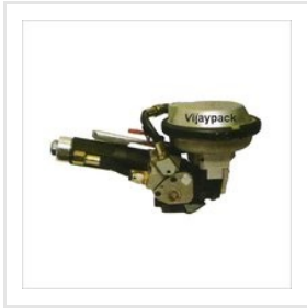
Pneumatic Steel Strapping Tool