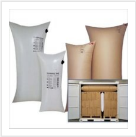
Dunnage Air Bag