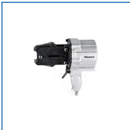
PNEUMATIC STEEL STRAPPING SEALER

Air Bubble Film, Battery Operated Strapping Tool, Colour Bopp Tape, Composite Strap, Cord Strap, Cord Strapping Tensioner, Dunnage Air Bag, Edge Guard, Heat Sealing Strap, LDPE Shrink Film, LLDPE Stretch Film, Manual Lashing Tensioner, Manual Strapping Tool, PET Strapping Sealer, PET Strapping Tensioner, etc.