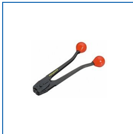
STEEL STRAPPING SEALER