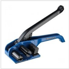
Manual Lashing Tensioner