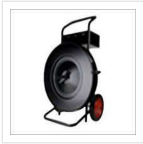
Pet Strap Dispenser