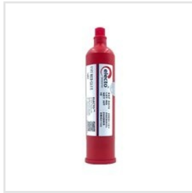
SMT Red RTV Adhesive Glue