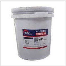
2006 A Potting