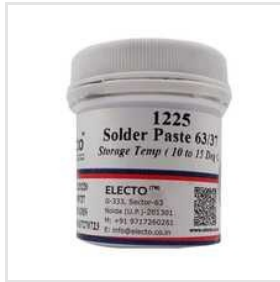
1225 Electo TDS Solder Paste