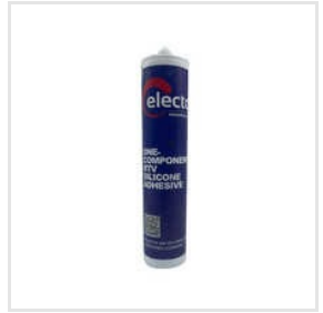
One Component RTV Silicone Adhesive