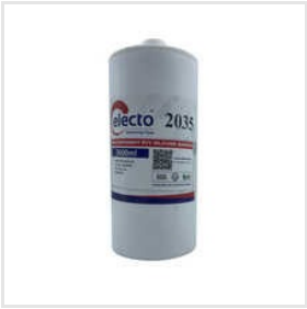
2600 MI One Component RTV