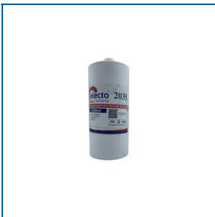
2600 ML ONE COMPONENT RTV SILICONE ADHESIVE

0.600 mm Solder Ball, 1225 Electo TDS Solder Paste, 1270 Electo Solder Paste, 2006 A Potting, 2006 B Potting, 2035 Electo Silicon Adhesive RTV, 2600 ml One Component RTV Silicone Adhesive, 2600ml One Component RTV Silicone Adhesive, 2610 Thermal Grease, 2630 Thermal Grease, 3027 Flux, Component RTV Silicone Adhesive, Component Solder Paste, One Component RTV Silicone Adhesive, SMT Red RTV Adhesive Glue, etc.