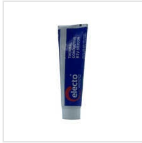
Thermal Conductive RTV Silicon