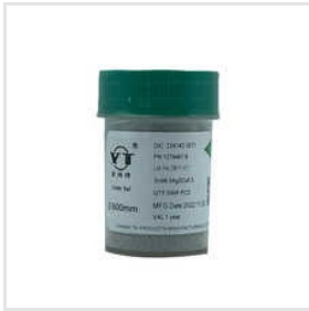
0.600 Mm Solder Ball