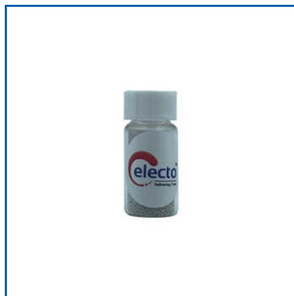
COMPONENT RTV SILICONE ADHESIVE