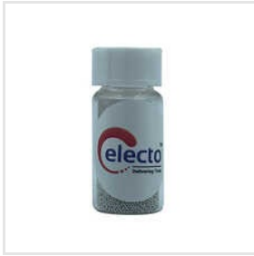
Component RTV Silicone Adhesive