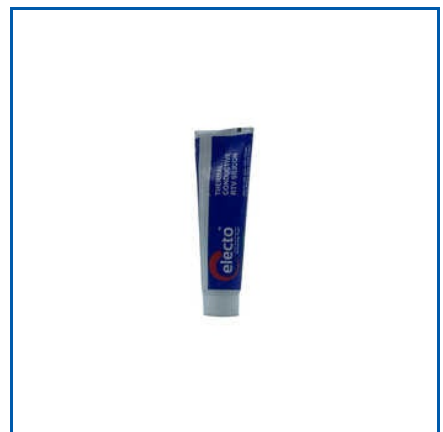
THERMAL CONDUCTIVE RTV SILICON