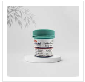
Component Solder Paste