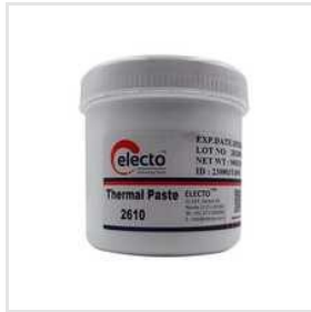
2610 Thermal Grease