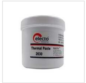
2630 Thermal Grease