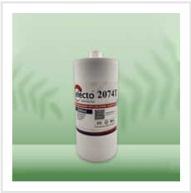
2600ml One Component RTV