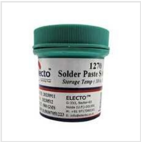
1270 Electo Solder Paste