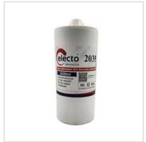
2035 Electo Silicon Adhesive RTV