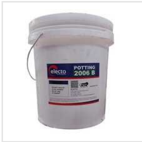
2006 B Potting