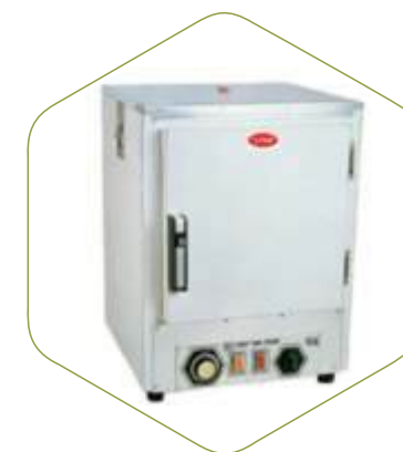
LYNX Hot Air Oven