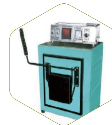
LYNX Muffle Furnace