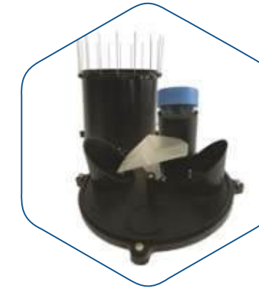
3554 WDI Digital Rain Gauge