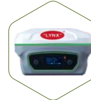
LYNX GPS LY1