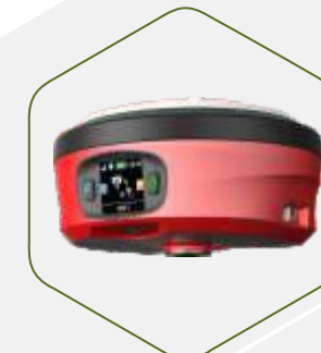
PENTAX GX2 GNSS Receivers