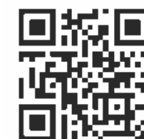
Vacuum Equipment and Systems