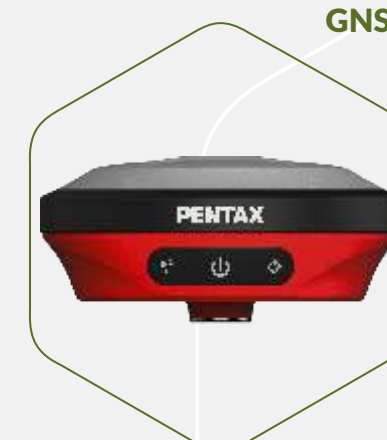
PENTAX GPS - G2U