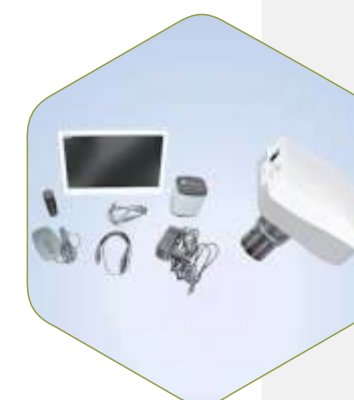
Imaging Systems Microscope