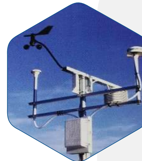
Hydro Meteorology Equipment