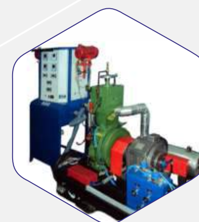
Computerised VCR Multi Fuel Engine Test Rig With EGR Setup