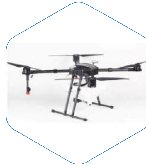
5L Spraying Drone