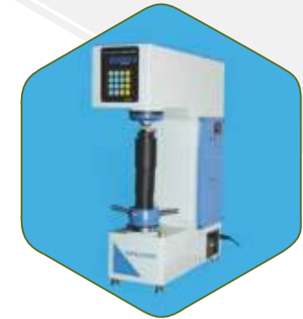
Rockwell Hardness Tester