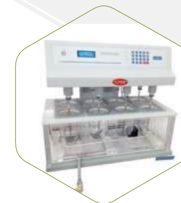
LYNX Dissolution Test Apparatus