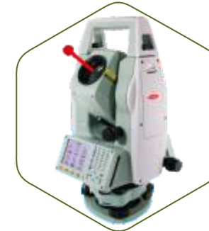
LYNX Total Station LTS-4