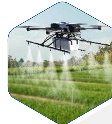
Drone Spraying Pesticide on Wheat Field