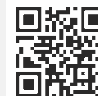
Material Testing Instruments