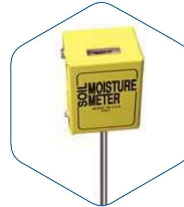
Soil Moisture Meter