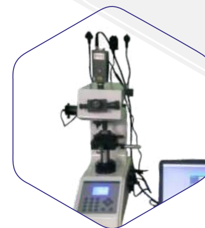
Computerised Micro Vickers Hardness Tester