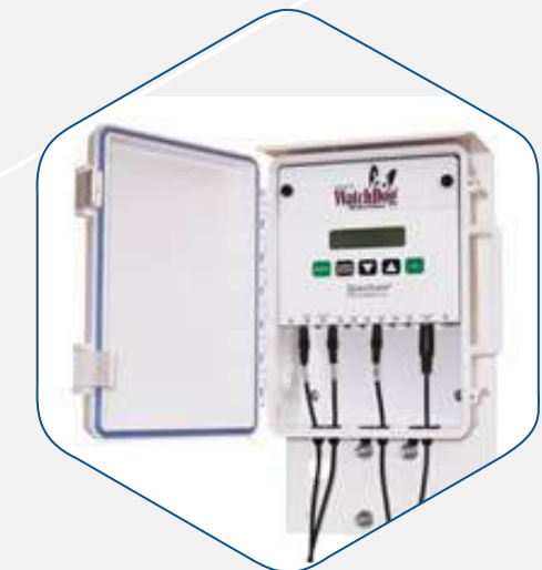
Watchdog 3345WD2 Weather Station