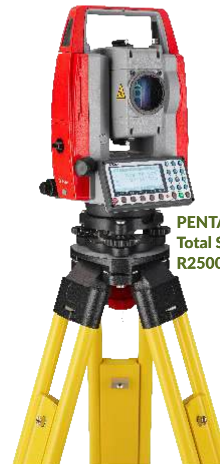
PENTAX Total Station R2500NS