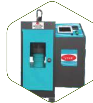
Fully Automatic CTM