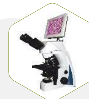
LM-52-1602 Apollo LM-52-1712 Digiscope Microscopes