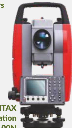
PENTAX Total Station V-100N