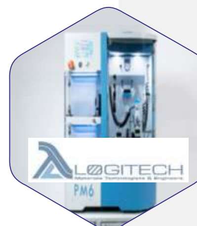
Logitech Precision Lapping and Polishing System