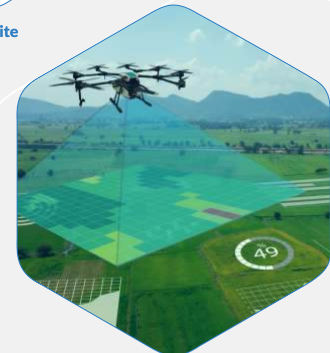
Agricultural Land Survey Drone