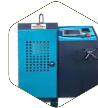
Semi Automatic CTM