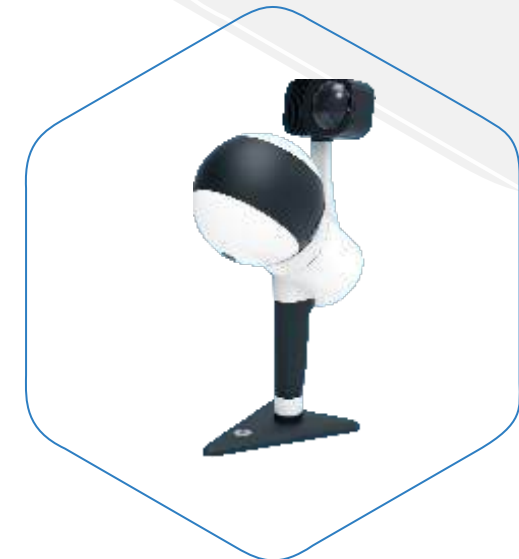
Hand Held Scanner