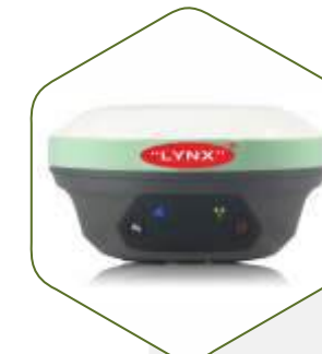
LYNX - LX1 GNSS Receiver