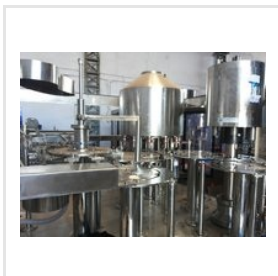
Rotary Filling Machine