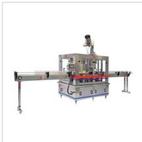
Monoblock Filling Machine