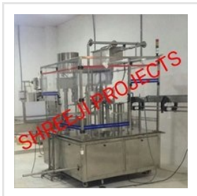
24 BPM Bottling Machine