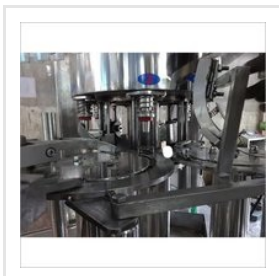
Bottle Rinsing Filling Capping Machine