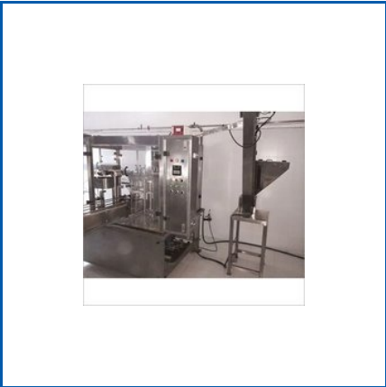
24 BPM BOTTLE FILLING MACHINE