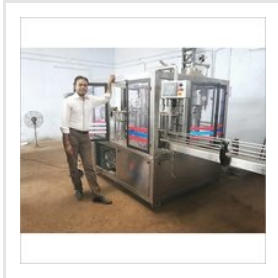
24 Bpm Filling Machine