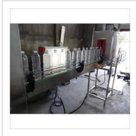
60 BPM Mineral Water Filling Machine