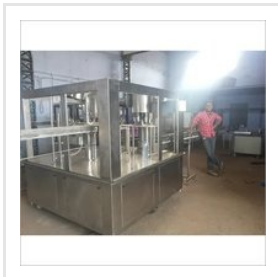
40 BPM Bottle Filling Machine