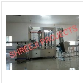
Water Bottling Plant And Machines