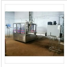
24 Bpm Rinsing Filling Capping Machine