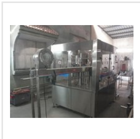
Mineral Water Filling Machine