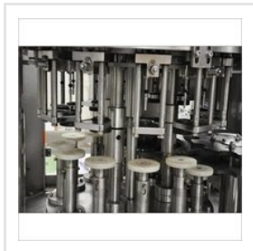
PLC Mineral Water Bottling Machine