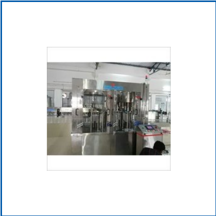
30 BPM BOTTLING MACHINE

120 BPM Bottle Filling Machine, 2000 Ltr SS Mineral Water Plant, 24 BPM Bottling Machine, 24 BPM Mineral Water Bottle Filling Machine, 24 bpm bottle filling machine, 24 bpm filling machine, 24 bpm mineral water packaging machine, 24 bpm rinsing filling capping machine, 30 BPM Bottle Filling Machine, 30 BPM Bottling Machine, etc.