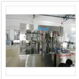
Packaged Drinking Water Machine