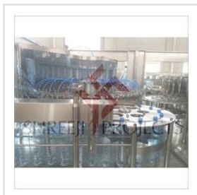
Packaged Drinking Water Bottling Plant