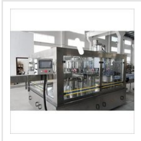
Fully Automatic Water Bottling Machine