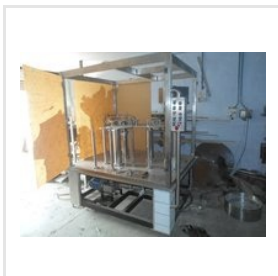
Pet Bottling Machine