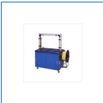
FULLY AUTOMATIC STRAPPING MACHINE

Automatic Batch Coding Machine, Automatic Liquid Filling Machine, Automatic Shrink Tunnel Machine, Battery Operated Strapping Tool, Box Strapping Machine, Box Strapping Roll, COTTON WICK MACHINE, Carton Sealing Machine, Carton Wrapping Machine, Coil Stretch Wrapping Machine, Continuous Band Sealer Machine, Currency Note Banding Machine, Double Color Pad Printing Machine, Electric BOPP Self Adhesive Tape, Electric Coding Machine, etc.