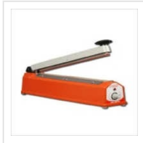
Impulse Sealer Machine