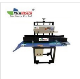
Continuous Band Sealer Machine