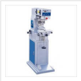
Double Color Pad Printing Machine