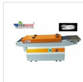
COTTON WICK MACHINE