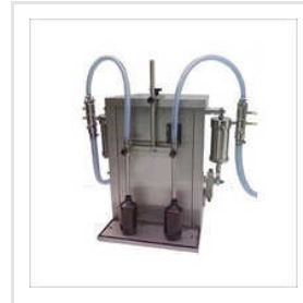
Automatic Liquid Filling Machine