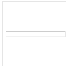
Electric BOPP Self Adhesive Tape