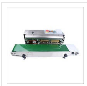
Horizontal Band Sealer