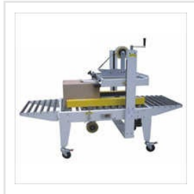
Carton Sealing Machine