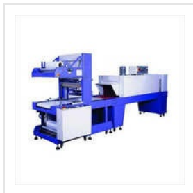
Automatic Shrink Tunnel Machine