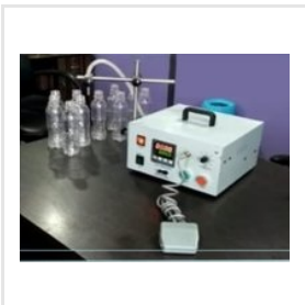
Single Nozzle Liquid Filling Machine