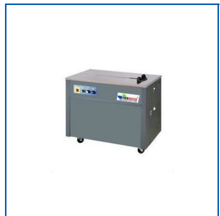
SEMI AUTOMATIC BOX STRAPPING HEAVY DUTY