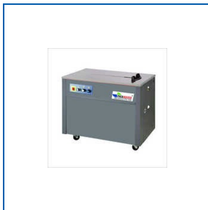
BOX STRAPPING MACHINE