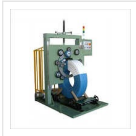
Coil Stretch Wrapping Machine