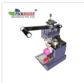
Manual Pad Printing Machines