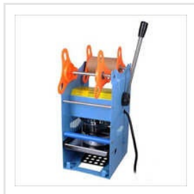
Manual Cup Sealing Machine