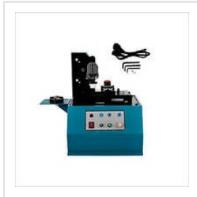
Pad Printing Machine