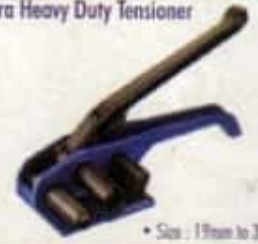
Extra Heavy Duty Tensioner