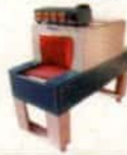
SHRINK WRAPPING MACHINE