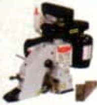
PORTABLE BAG CLOSER SEWING MACHINE