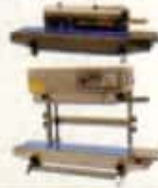
CONTINUOUS BAND SELLER (VERTICAL & HORIZONTAL)