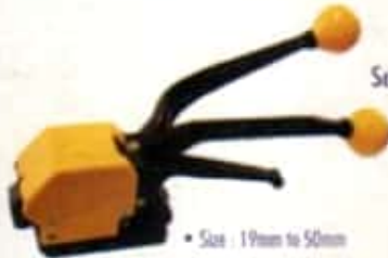
Sealless Steel Strapping Combination Tool

Tensioning, sealing & Cutting all in one Strap Gauge : 0.38 to 0.69mm one tool works for 12mm, 16mm and 19mm