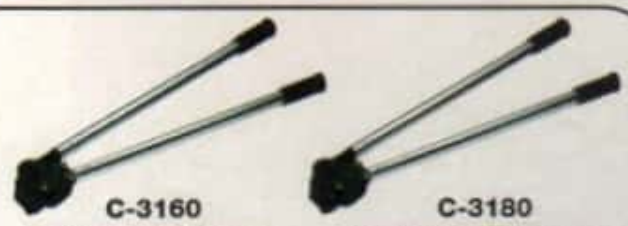
C-3160 HEAVY DUTY 19 mm