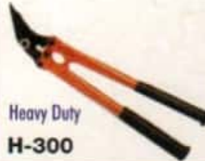
Heavy Duty H-300

Carbon steel drop forged cutter with wide blade