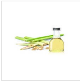
Lemon Grass Oil