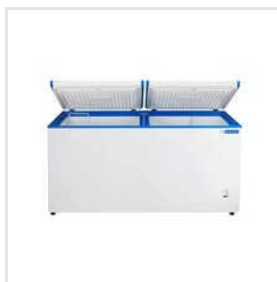
Voltas Hard Top Deep Freezer