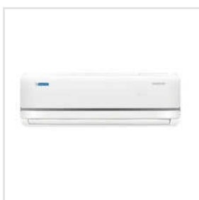
Blue Star 1 Ton 3 Star Air Conditioner