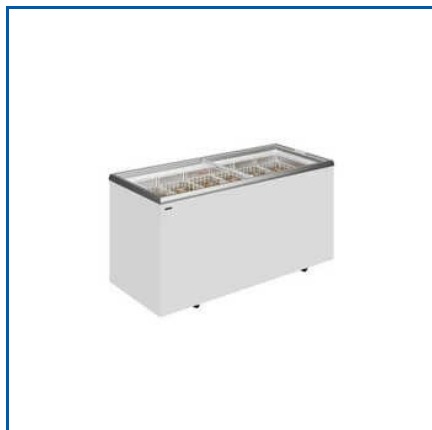
VOLTAS GSL 120 DEEP FREEZER

05_Blue Star VC325D Western Visi Cooler, 100 LPH RO Plant, 1000 LPH Mineral RO SS Plant, 1000 LPH RO Plant, 1000 LPH Softener Plant, 120Ltr Usha Water Cooler, 2 Door Under Counter Freezer With Prepration Table, 2 Door Vertical Freezer, 2.5Ltr Blue Star E Series Table Top Water Dispenser, 2000 LPH RO Plant, etc.