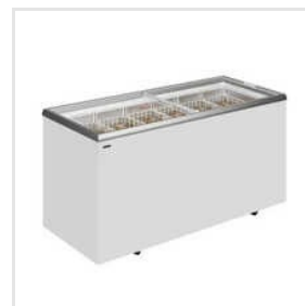
Voltas GSL 500 Deep Freezer