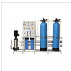
2000 LPH RO Plant