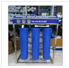
100 LPH RO Plant