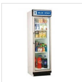
Blue Star VC400A Western Visi Cooler