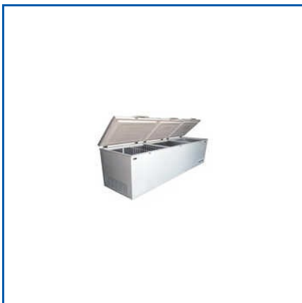
HARD TOP CHEST FREEZER