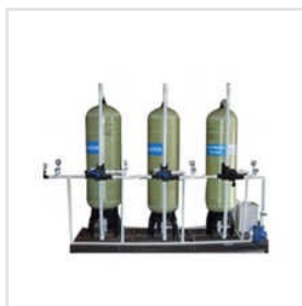
2000 LPH Water Demineralization Plant