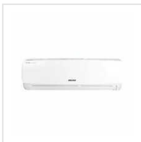
Voltas 1.5 Ton Split Air Conditioner