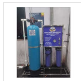
500 LPH UV And Sand Filter Plant