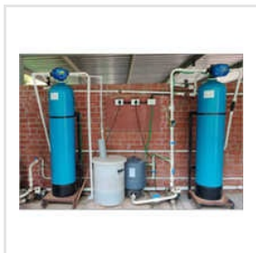
1000 LPH Softener Plant