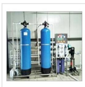
1000 LPH RO Plant