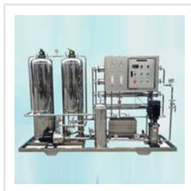
1000 LPH Mineral RO SS Plant