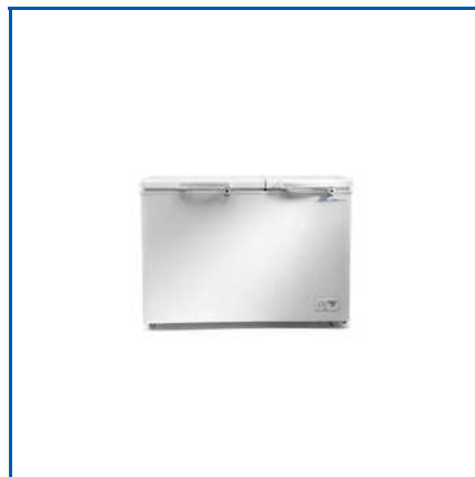
VOLTAS HARD DEEP FREEZER