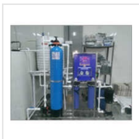
250 LPH RO Plant