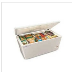
Voltas CC HT 205 SD Deep Freezer