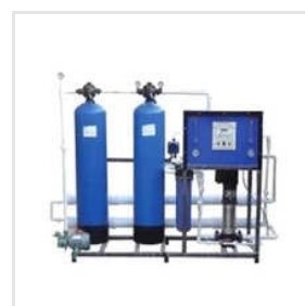
Commercial RO Water Plant