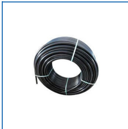
140MM AGRICULTURE HDPE PIPE