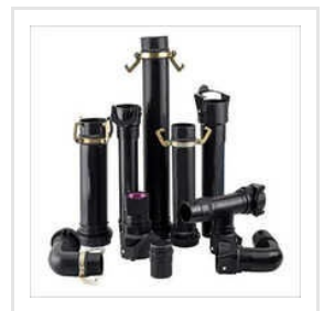
Agriculture Sprinkler Pipes