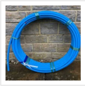
Blue Mdpe Pipe