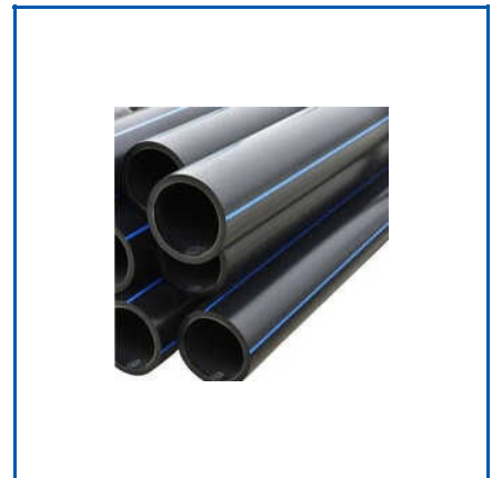
HDPE UNDERGROUND WATER PIPE