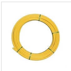
20mm Yellow Color Mdpe Pipe