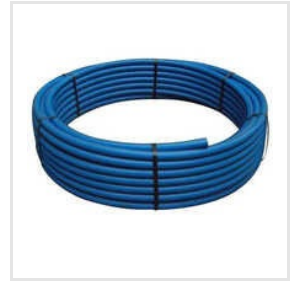
25mm MDPE Pipe