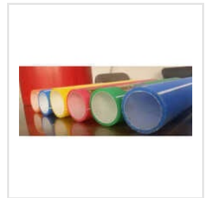
PLB HDPE Duct Pipe