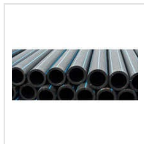
HDPE Black Duct Pipe