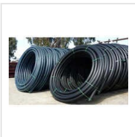
HDPE Water Supply Pipe