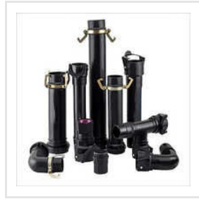
Black Hdpe Sprinkler Pipe