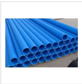
Agricultural HDPE Pipe