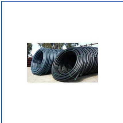
HDPE COIL PIPE

140mm Agriculture HDPE Pipe, 20mm Yellow Color Mdpe Pipe, 25mm MDPE Pipe, Agricultural HDPE Pipe, Agriculture Sprinkler Pipes, Black Hdpe Sprinkler Pipe, Blue Mdpe Pipe, HDPE Black Duct Pipe, HDPE Coil Pipe, HDPE Duct Pipe, HDPE Underground Water Pipe, HDPE Water Pipe, HDPE Water Supply Pipe, PE80 HDPE Pipe, PLB HDPE Duct Pipe, etc.