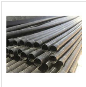
HDPE Duct Pipe