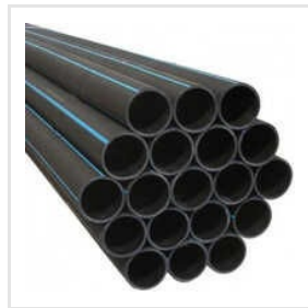
PE80 HDPE Pipe