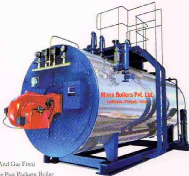
Oil And Gas Fired Three Pass Package Boiler