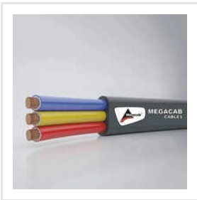
Pvc Sheathed Cables