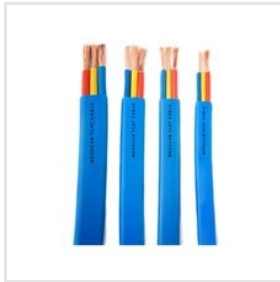
Submersible Pump Cable