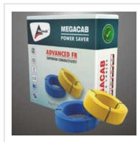
Pvc Insulated Cable