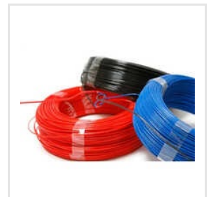
Multi Strand Wire