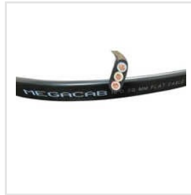
PVC Submersible Flat Cable