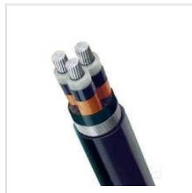
3 Core Armoured Cable