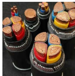
3 CORE COPPER ARMoured CABLE