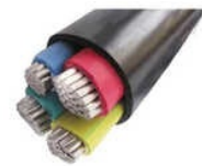
3.5 CORE ALUMINIUM ARMoured CABLE