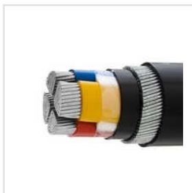
Three Core Aluminium Xlpe Wire