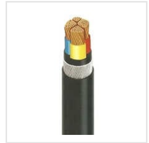
Megacab 4 Core LT Copper Armoured XLPE