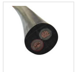
Flexible Copper Cables