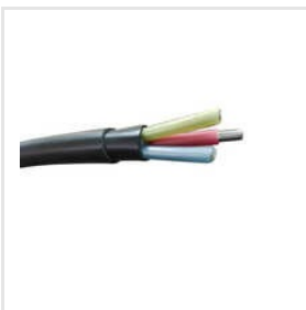
Three Core Unarmoured