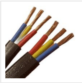
Submersible Flat Cable