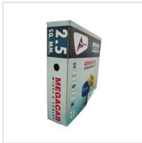
Electrical House Wiring