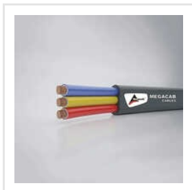
PVC Insulated Submersible Cable