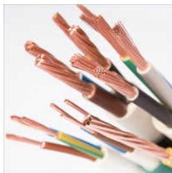
ROUND FLEXIBLE CABLE

1 Core PVC Electrical Cable, 1100 V PVC Flexible Cable, 2 Core Aluminum Armoured Cable, 2 Core PVC Flexible Cable, 3 Core Armoured Cable, 3 Core Copper Armoured Cable, 3 Core Flat Submersible Cable, 3 Core Flat Xlpe Cables, 3 Core PVC Insulated Flexible Cable, 3.5 Core Aluminium Armoured Cable, 4 Core Aluminum Armoured Cable, etc.