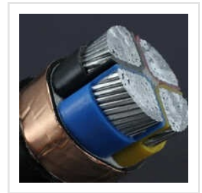
Aluminium Armoured Cable