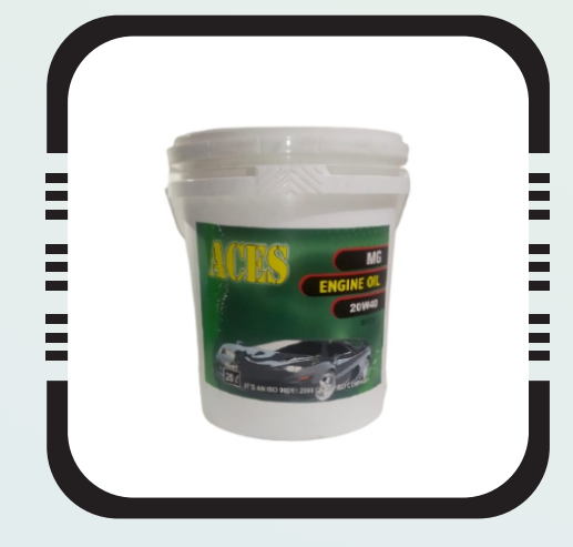
ENGINE OIL 20W40 SF CD