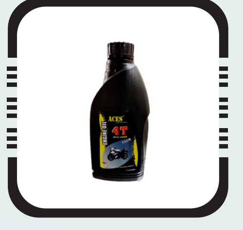
FOUR STROKE ENGINE OIL 10W30