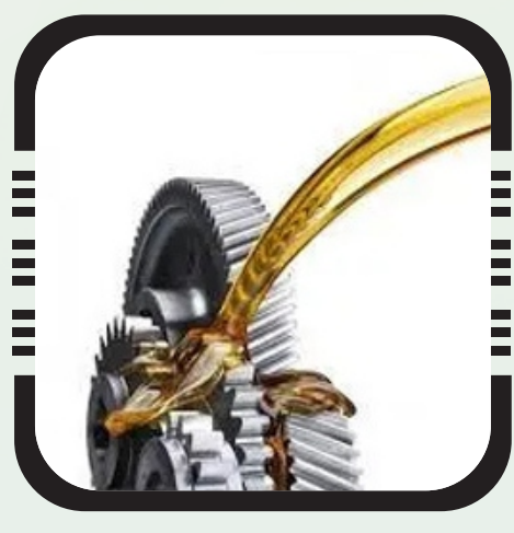
LOW SSI PMA VISCOSITY INDEX IMPROVER