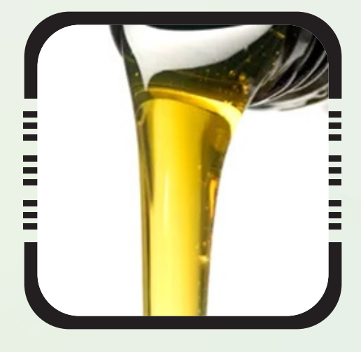
2T OUTBOARD ENGINE OIL ADDITIVE