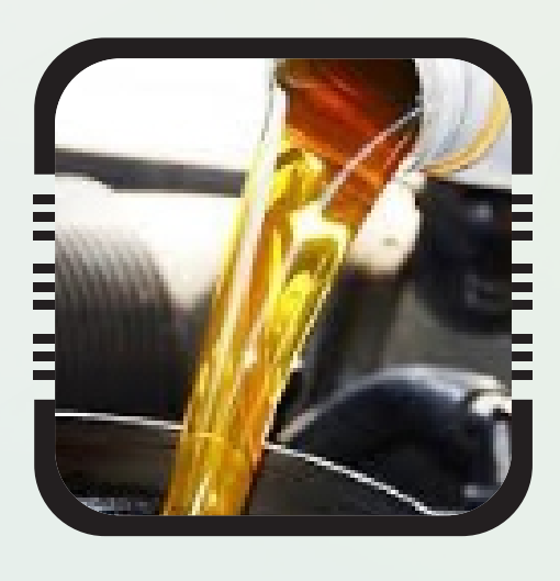
ENGINE OIL ADDITIVE WITH POUR POINT EFFECT