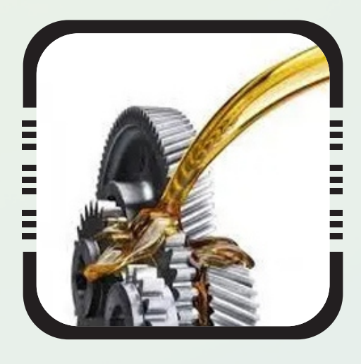
ASHLESS ANTIWEAR ANTICORROSION ADDITIVE