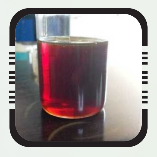
ENGINE OIL ADDITIVE WITH POUR POINT EFFECT