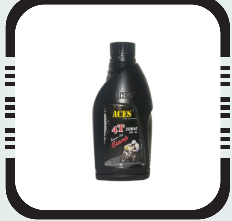
BIKE ENGINE OIL 20W40 SL