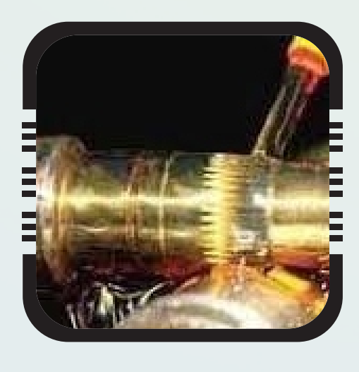
RUST PREVENTIVE OIL ADDITIVE