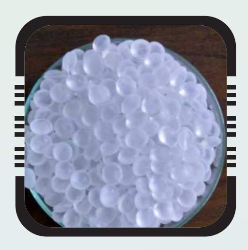
VISCOSITY INDEX IMPROVER POLYMER