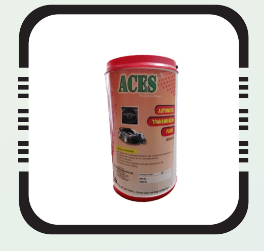
AUTOMATIC TRANSMISSION OIL