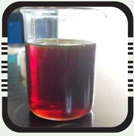
ENGINE OIL ADDITIVE BS6 ENGINES