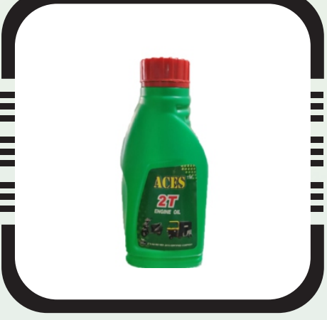
TWO STROKE ENGINE OIL