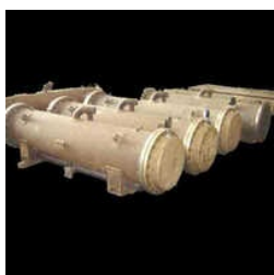
P15 Heat Transfer Condenser