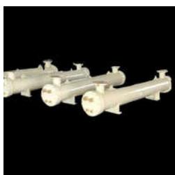
Shell And Tube Heat Exchanger