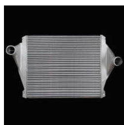
Charge Air Cooler For Gas Engine