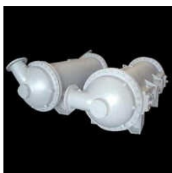
Lube Oil Cooler