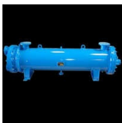
Industrial Marine Water Cooler