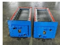
Inter Cooler For After Elliot Compressor