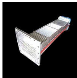
INDUSTRIAL INTERSTAGE COOLER