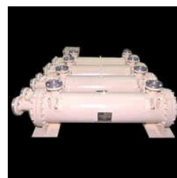
BCS Heat Exchanger For Submarine