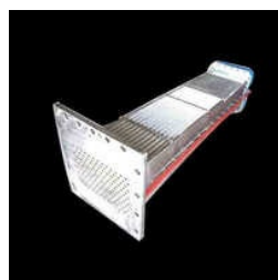
Industrial Intercooler Compressor