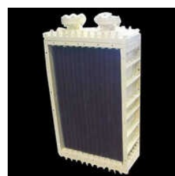
Bildge Air Cooler