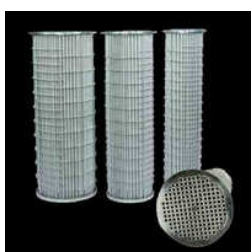
ZH And ZHC Interstage Coolers