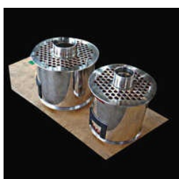
Centac Air Cooler