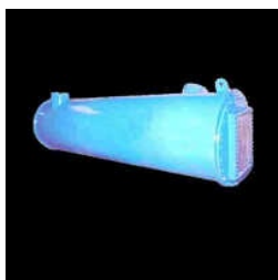
Cameron Interstage Coolers