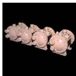
NECS Heat Exchanger For Submarine