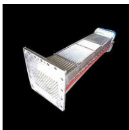
Industrial Interstage Cooler