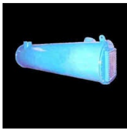
CAMERON INTERSTAGE COOLERS

BCS Heat Exchanger For Submarine, Bidge Air Cooler, Cameron Interstage Coolers, Centac Air Cooler, Charge Air Cooler For Gas Engine, Industrial Intercooler Compressor, Industrial Interstage Cooler, Industrial Marine Water Cooler, Inter Cooler For After Elliot Compressor, etc.