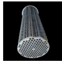
ZR INTERSTAGE COOLERS