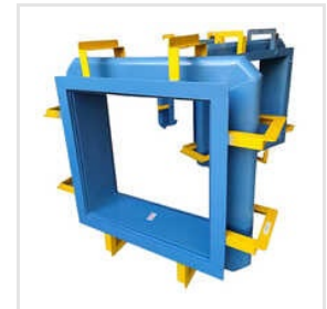
Double Miter Square Expansion Bellows