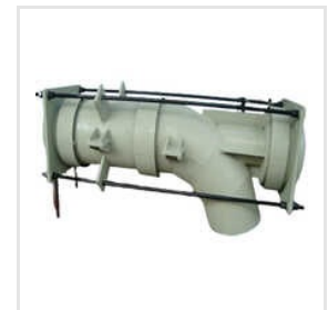
Pressure Balanced Expansion Joint