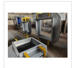
Camera Corner Expansion Bellows