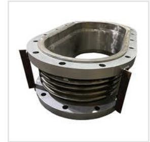
Capsule Expansion Bellows