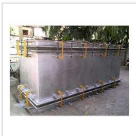
Rectangular Bellows Expansion Joint