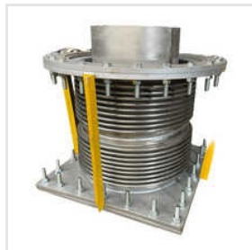
Universal Expansion Bellows With One Side