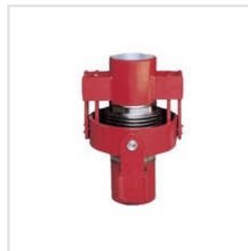
Gimbal Expansion Bellows