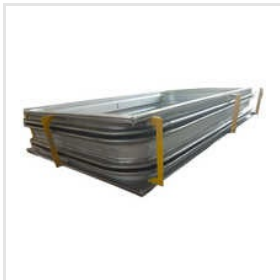
Round Corner Expansion Bellows