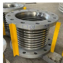
STAINLESS STEEL EXPANSION JOINT BELLOW