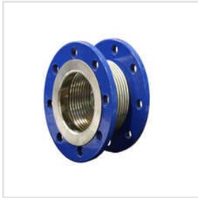
INDUSTRIAL EXPANSION BELLOW