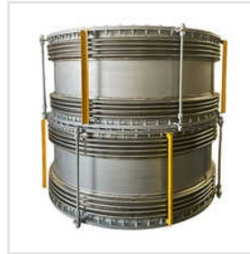
Industrial Universal Expansion Bellows