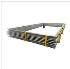
Rectangle Type Expansion Bellows