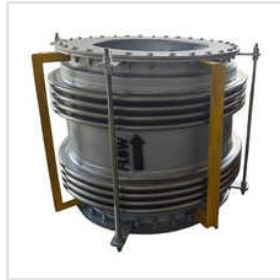
Universal Tied Expansion Bellows With