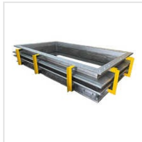
Rectangle Expansion Bellows