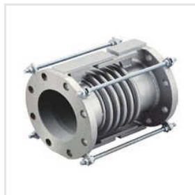
Hinged Expansion Bellows